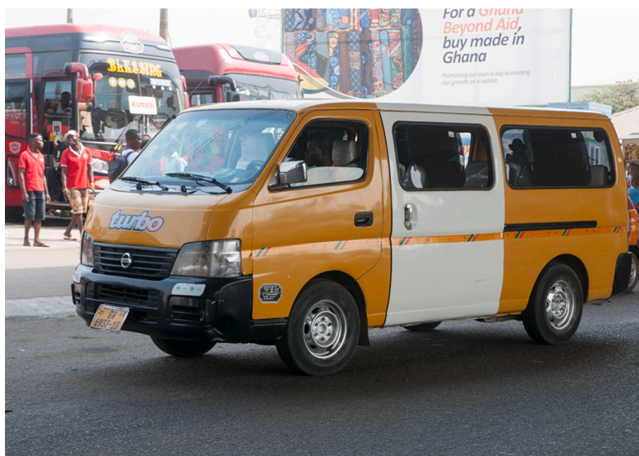
Fig. 1. A trotro (minibus share taxi) makes its way through the traffic at Accra.

This work was conducted under the umbrella of the Urban Health Initiative pilot project, a partnership between the World Health Organization, Accra Metropolitan Assembly, Ghana Health Service, Ghana Environmental Protection Agency, World Health Organization's international implementing partners, UN-Habitat and the Local Governments for Sustainability, all members of the Climate and Clean Air Coalition. The main goal of the Urban Health Initiative is to strengthen the health evidence around urban environment issues affecting population health by making the best use of the local knowledge, data, and expertise. The primary entry point for the pilot project in Accra was tackling air pollution, particularly short-lived climate pollutants. Key steps within the Urban Health Initiative process include identification and engagement with relevant local stakeholders in the transport sector, mapping