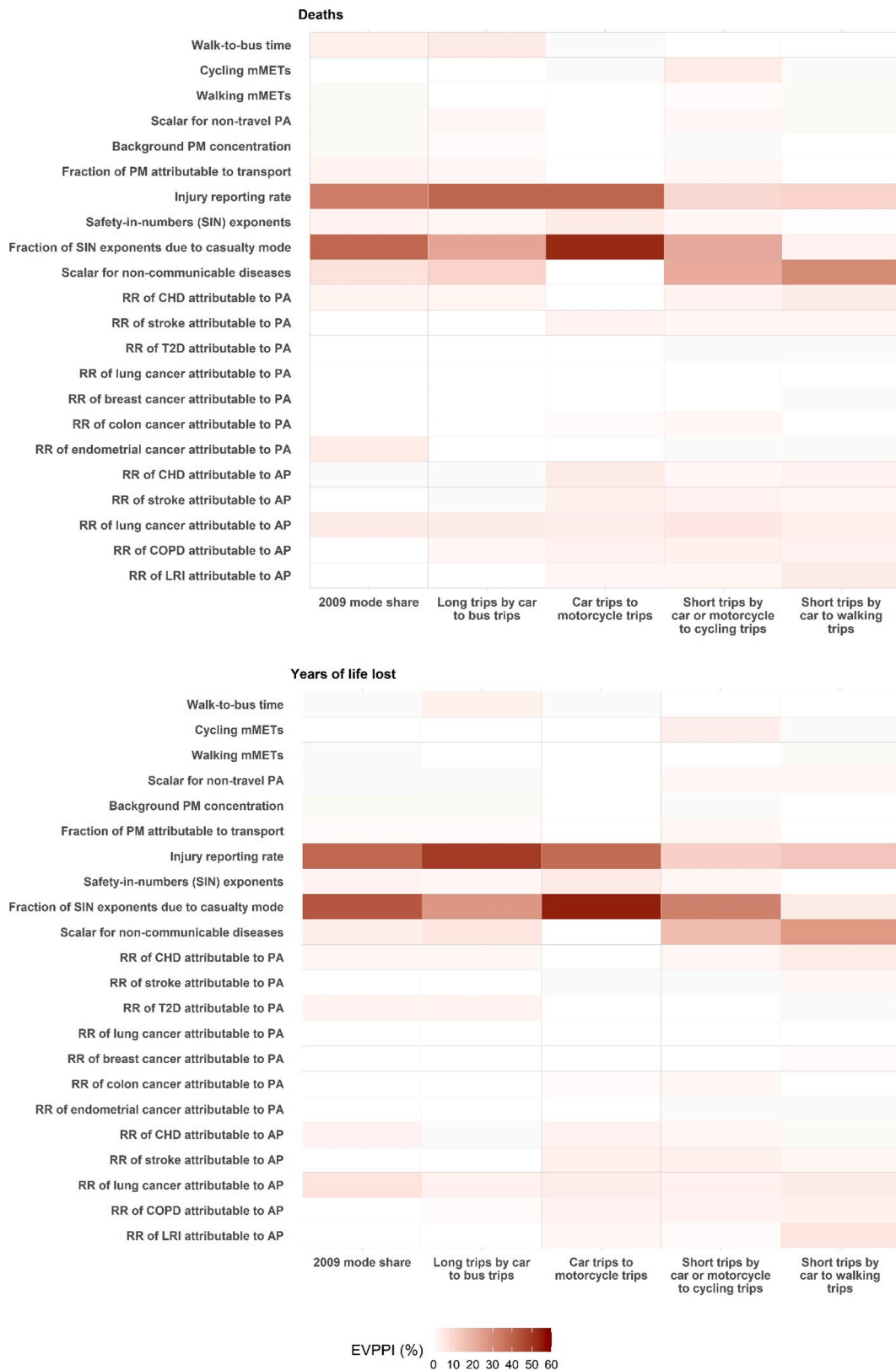
Fig. 4. Expected value of partial perfect information (EVPPPI), expressed as percentage of the outcome variance explained by parameter uncertainty, by outcome (deaths and years of life lost) and scenario. CHD: chronic heart disease; COPD: chronic obstructive pulmonary disease; LRI: lower respiratory infection; mMETs: marginal metabolic equivalent of tasks; PA: physical activity; PM: particulate matter with 2.5- \mu m diameter (PM 2.5 ); RR: relative risk; SIN: safety-in-numbers; T2D: type-2 diabetes mellitus.