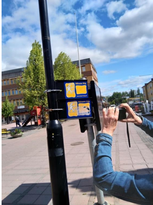
Fig. 2. Photo documentation during fieldwork in Kramfors, June 2019.