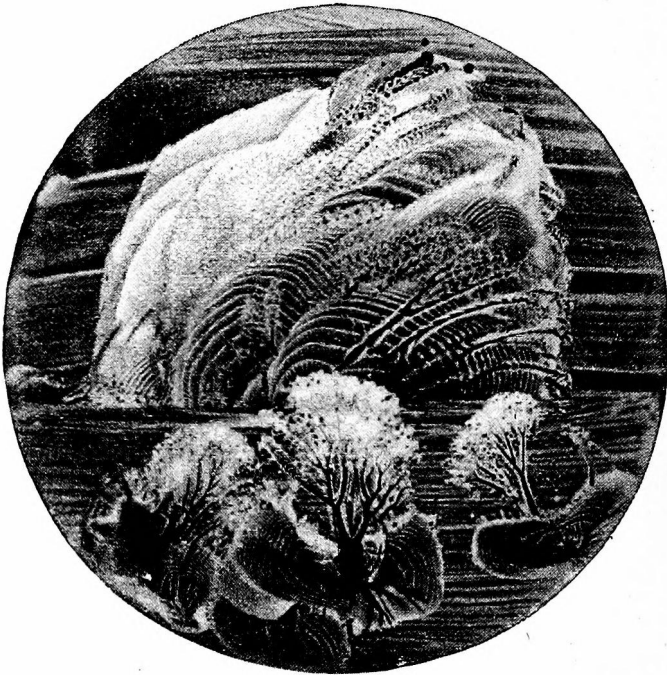
FIG. 53.—Seaweed or landscape form.

in The Century Magazine for May, 1891. They were obtained by singing into an instrument called the eidophone (Fig. 52). It is a simple tube bent upward at one end, over which a membrane of india