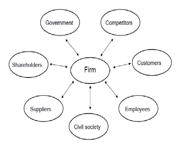
Figure 3- Freeman's Stakeholder Map

In one of his most significant contributions Freeman proposes a stakeholder map (see Figure 3) wherein he begins to organize stakeholders into a system with the firm at the center surrounded by its stakeholders.