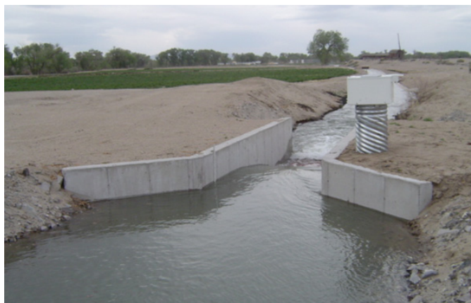
Figure 6. Standard TCID Replogle flume with water flowing