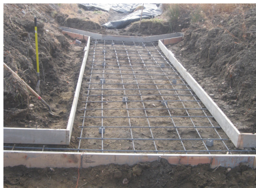
Figure 3. Framework and steel for the foundation