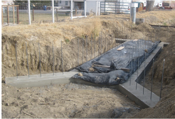
Figure 4. Vertical steel rebar to be used for the walls of the flume contraction