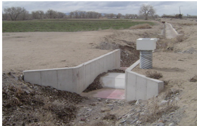
Figure 5. Standard TCID Replogle flume