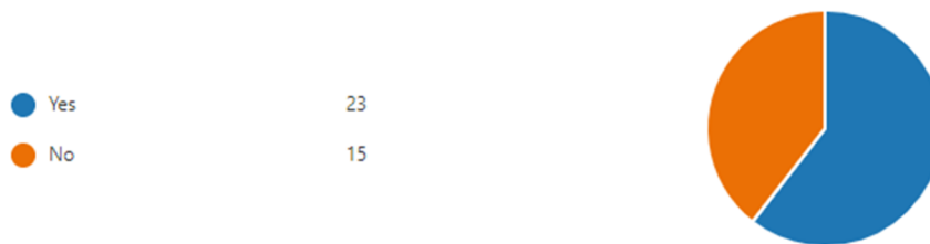
Figure 11: Response to question 7: If you do not own a smart home device are you interested in adding some to your residence?

The last question of the survey was to find data regarding people's interests in smart home devices. Only thirty-eight people replied to this question and twenty-three of those would be interested in adding a product into their home. However, fifteen of those responses said that they were not interested.