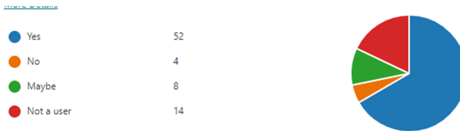
Figure 10: Response to question 6: Would you recommend your family members or friends to get a smart home product?

In a world where everyone had a smart device, households would have more time and convenience when doing daily tasks. The question asked was if participants would recommend a smart home product for friends and family. Fifty-two users replied that they would recommend a smart home device to others and four replied that they would not. Eight of them said maybe and fourteen of them said they were not users.