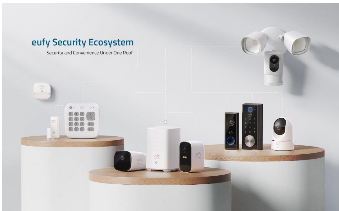
Figure 6: Eufy Security EcoSystem (Eufy, 2021)

Smart locks have made it extremely convenient for people to enter their homes and see when the door was locked or unlocked, and allow users to forgo keys entirely (SafeWise, 2021). With smart locks, there is no more wondering if the door was locked before leaving the premises, the user could simply look at their phone application and lock it remotely if they wanted to. With an added doorbell camera, homeowners would be able to view who is at the front door if the doorbell is rung. These smart devices have made it extremely simple to add a little security to their home if they decide to not fully commit to an outdoor smart camera system quite yet or deem it not necessary.