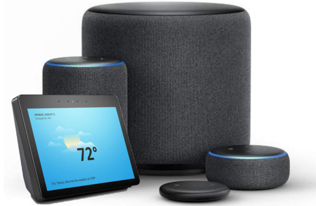
Figure 2: Amazon Echo Smart Speakers (Patterson, 2019)

Another big company that features one of their top tier smart speakers is Amazon. Their form of the “personal assistant” is called Alexa. Amazon’s Echo “holds the lion’s share of the dedicated voice speaker market and has a more diverse lineup of gadgets” (Linder, C. 2021). Amazon’s Echo, like the Google Home, can help automate daily tasks of turning on and off lights, setting alarms, controlling home temperature, and much more. With Amazon Echo there are thousands of products that could be used in conjunction with the smart speaker listed on the Amazon website.