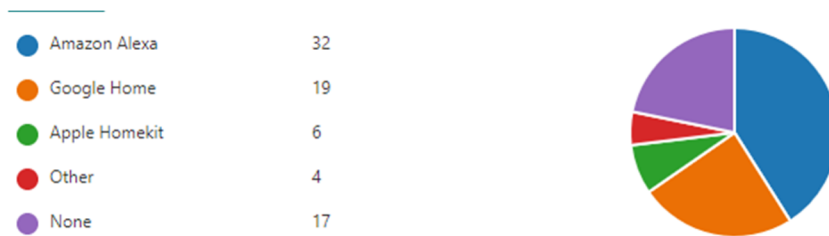
Figure 8: Responses to question 2: Do you use Amazon Alexa, Google Home, or Apple Homekit?

The second question asked the respondents if they used Amazon Alexa, Google Home, or Apple HomeKit. The results varied greatly between each respondent with Amazon Alexa holding the largest category of users, and Google Home coming in second. Other users used Apple HomeKit, other devices, or were not users of smart home devices. Thirty-Two respondents said they used Amazon Alexa, nineteen of them used Google Home, six used Apple HomeKit, four used other devices, and seventeen said they did not use any of these devices.