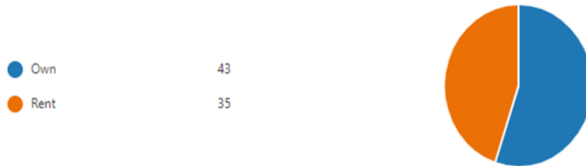
Figure 7: Responses to question 1: Do you own or rent your current residence?

The second question asked the respondents if they used Amazon Alexa, Google Home, or Apple HomeKit. The results varied greatly between each respondent with Amazon Alexa holding the largest category of users, and Google Home coming in second. Other users used Apple HomeKit, other devices, or were not users of smart home devices. Thirty-Two respondents said they used Amazon Alexa, nineteen of them used Google Home, six used Apple HomeKit, four used other devices, and seventeen said they did not use any of these devices.