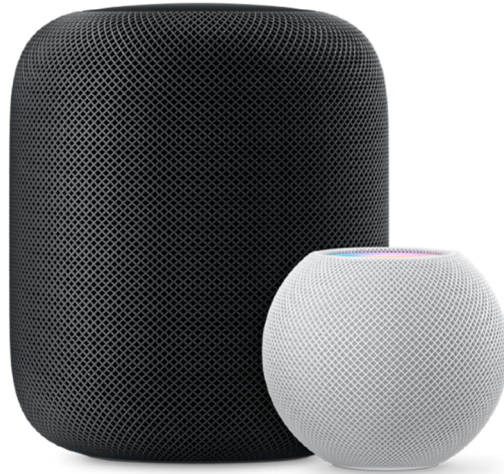
Figure 3: Apple HomePod Smart Speakers (Apple, 2021)

application and control their home devices from anywhere in the world with an internet connection. With the HomePod there are a total of 48 devices listed that are compatible.