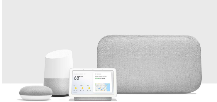
Figure 1: Google Home Smart Speakers (Amadeo, 2020)

assistant” is called the Google Assistant. Google Home is one of the few options that combines many different functions, giving the home occupants a central system to have control over all the functions.