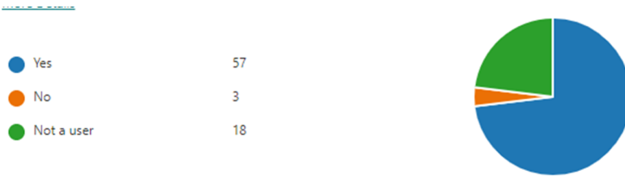
Figure 9: Response to question 4: Does this smart home product add value to your life?

In a world where everyone had a smart device, households would have more time and convenience when doing daily tasks. The question asked was if participants would recommend a smart home product for friends and family. Fifty-two users replied that they would recommend a smart home device to others and four replied that they would not. Eight of them said maybe and fourteen of them said they were not users.