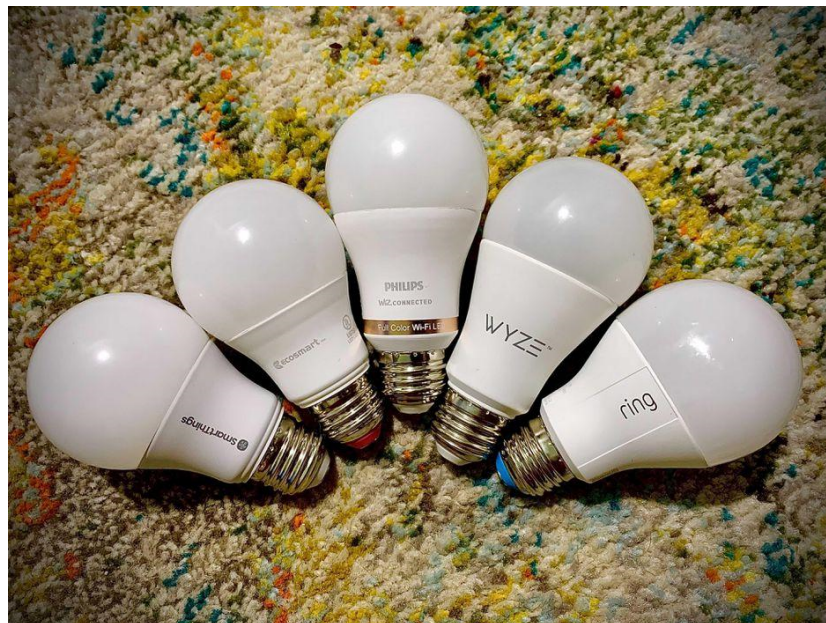
Figure 4: Smart Light Bulbs (Crist, 2020)

Several other brands on the market have their own light bulbs that could be used to replace current light bulbs in homes. Depending on the needs of the individual, they could decide which light bulb would best fit their needs. Prices of smart bulbs can vary greatly depending on their functionality. Essentially, smart light bulbs use a hint more energy than a regular LED bulb. When comparing a Philips HUE smart bulb to a standard Philips LED bulb, the wattages are seven watts and five watts, respectively. In a 2020 study done by the owner of the LED Lighting Info, bulbs were running two hours a day, the smart bulb cost $0.15 and the regular LED cost $0.11, in the end the difference is insignificant (Eugen, 2020). In any event, changing lights from traditional CFL and incandescent bulbs to LEDs would be beneficial.