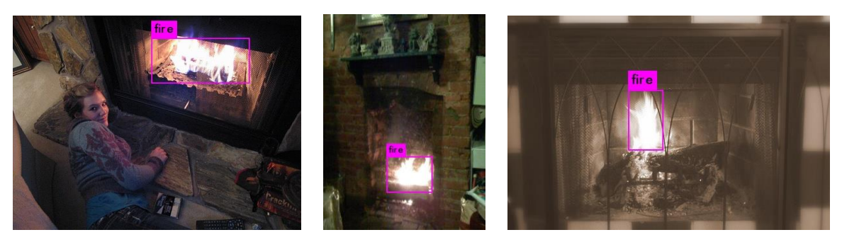
(b) Fire images. Fig. 3 Some instances detected by the trained network.