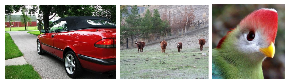
(a) No fire images.