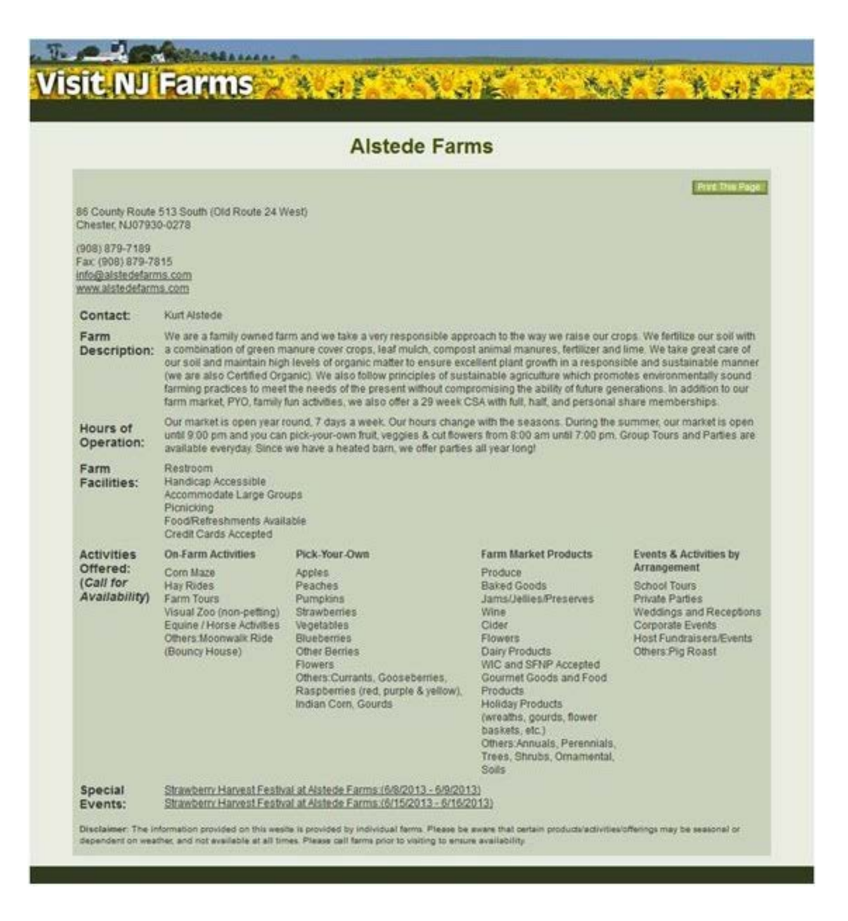
Figure 2. Screen Capture of the Visit NJ Farms Travel Itinerary Builder