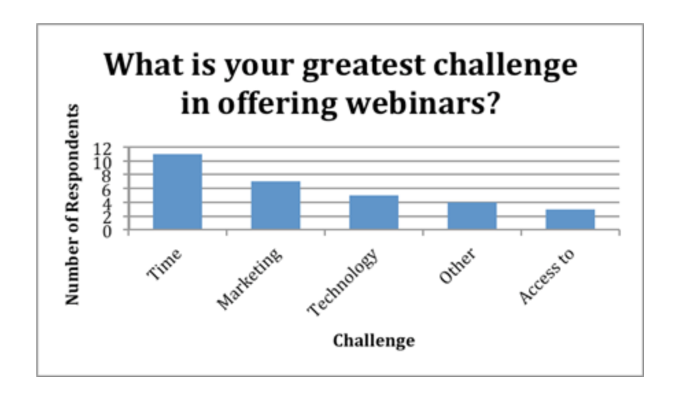
Figure 3. Respondents' Greatest Challenge to Offering Webinars

Respondents were asked to note the greatest challenge to offering a webinar. Choices included time commitment, marketing, access to high-quality speakers, evaluation, technology, and other. The number one challenge to offering webinars according to the respondents was time commitment. Respondents also noted marketing, technology, and access to high-quality speakers as challenges. However, no respondents stated that evaluation was the greatest challenge (Figure 3).