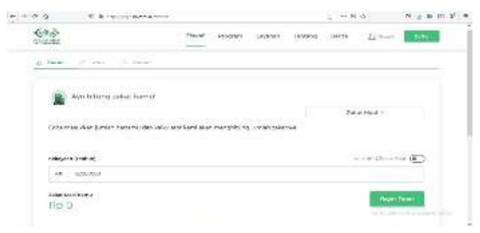
Figure 1. Display for Zakat Calculator

The following is the result of the ZIS fund collection managed by NU CARE-LAZISNU DIY from 2013-2020 (Nuha, 2020):