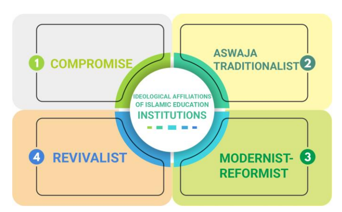
Figure 2 Ideological Affiliations of Islamic Educational Institutions