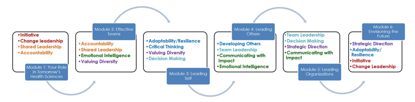
Figure 2 Midcareer faculty leadership program curriculum map.

Once we have a general idea of the content areas and program arc, we fill in the curriculum topics, identifying approaches to engage participants and make the learning experiential. When implementing our programs, we recruit individuals from across Boston University and beyond, to facilitate sessions. We identify facilitators based on their role, area of expertise, and areas of interest. For example, we engage staff from the Faculty/Staff Assistance Office or faculty with expertise on campus to speak to issues about mentoring, building peer networks, leading high performing teams, or managing conflict and difficult conversations. We work with facilitators using a facilitator's guide template (Supplement 1), including diverse and creative strategies to foster experiential learning. The template ensures that facilitators plan the topic, content, and activity or pedagogy to ensure learning and application. During each session, participants are asked to make a commitment (eg, commit to practicing one time management strategy in the net week) and evaluate the session for future iterations. Each of our programs includes time for small group peer mentoring and/or longitudinal learning communities.