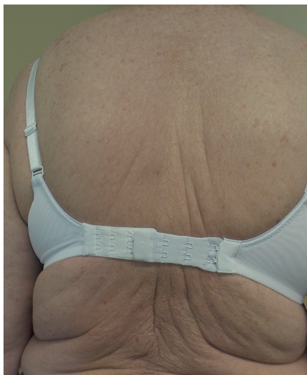
Fig. 2. Psoriasis on the back of a patient in the active treatment group at week 26 (Psoriasis Area Severity Index: 0.7).

or increase in plasma cytokines from baseline to week 26 were reviewed for all measured cytokines. The results for IL-17A and IL-23 are shown in Table III .