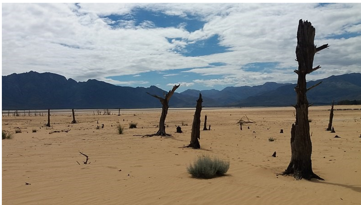
Figure 1. A portion of Theewaterskloof dam, close to empty in 2018, showing tree stumps and sand usually submerged by the water of the dam (Photo by Zaian/CC BY-SA).

below 13.5 percent [8]. In early 2018, the consequences of the drought were evident and the main reservoirs around Cape Town were running dry as can be seen from Figure 1.