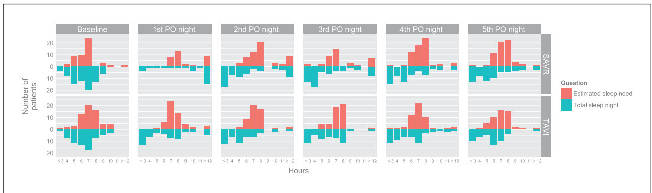
Figure 1. Self-reported sleep and sleep need in octogenarian patients after SAVR or TAVI at baseline and on the first five postoperative nights (N = 143).

PO: postoperative; SAVR: surgical aortic valve replacement; TAVI: transcatheter aortic valve implantation.