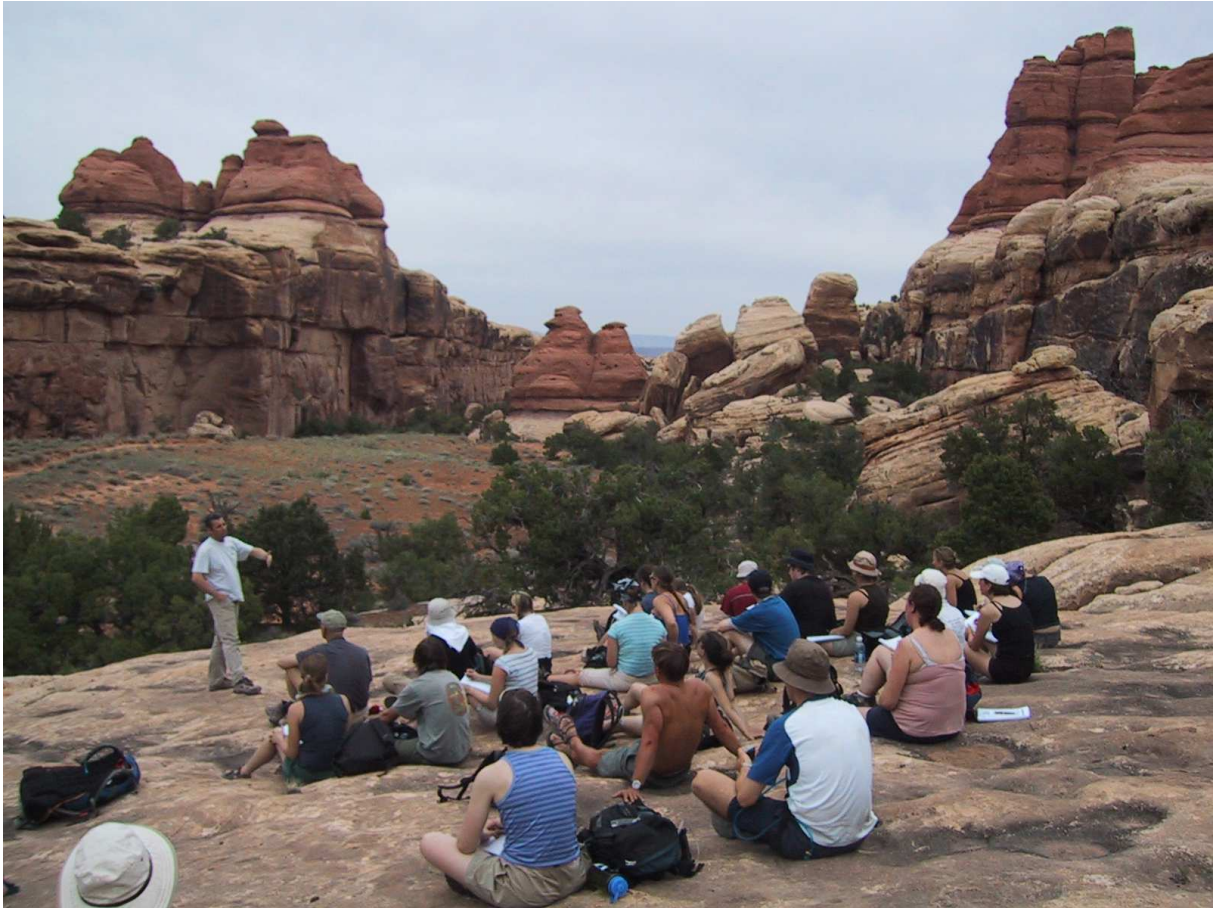
Figure 6: Towards the end of a location visit, the participating groups gather together for a common discussion of both location-specific and case-specific problems.

The industry employees would work much the same way as the students. However, no group was responsible for documenting the day. This was taken care of by the course supervisors. The reason for this difference is related to the need for students to qualify for course units, as well as practice in preparing and presenting material orally. Industry employees are more familiar with this type of work conditions. In addition, it was a main focus to bind the industry employees together, a purpose which would be hard to accomplish by having one group work each evening.