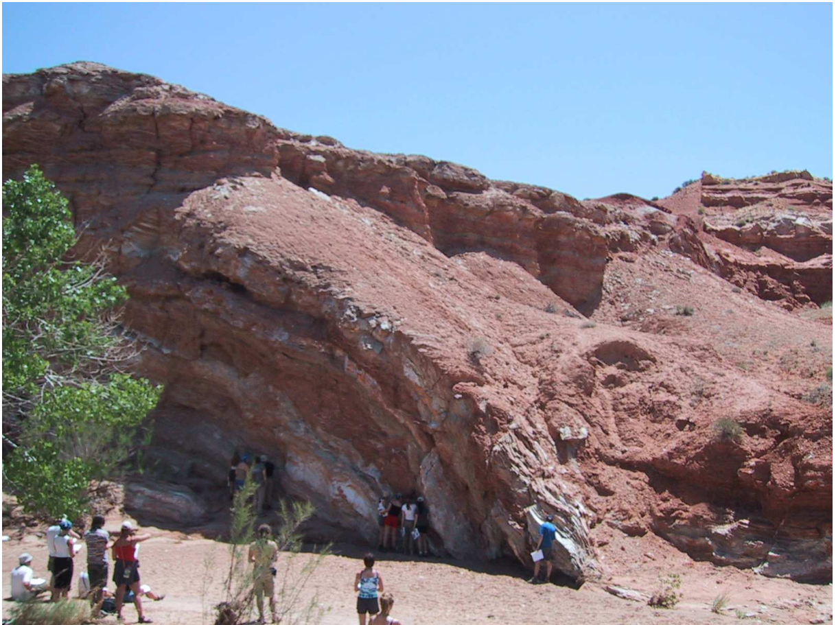
Figure 5: Student groups working at a location discussing case-specific and location-specific problems.

(Figure 5). They would use the field guide, draw sketches and discuss the location specific questions provided in the field guide as well as the broader context questions provided in ContentManager (also available in paper format). For the student field trip, one group would be responsible for documenting the field day. This group would gather information and pictures, using a digital camera, from the different localities. In the evening, the group would develop a Microsoft® PowerPoint-presentation which would be presented the next day by the group.