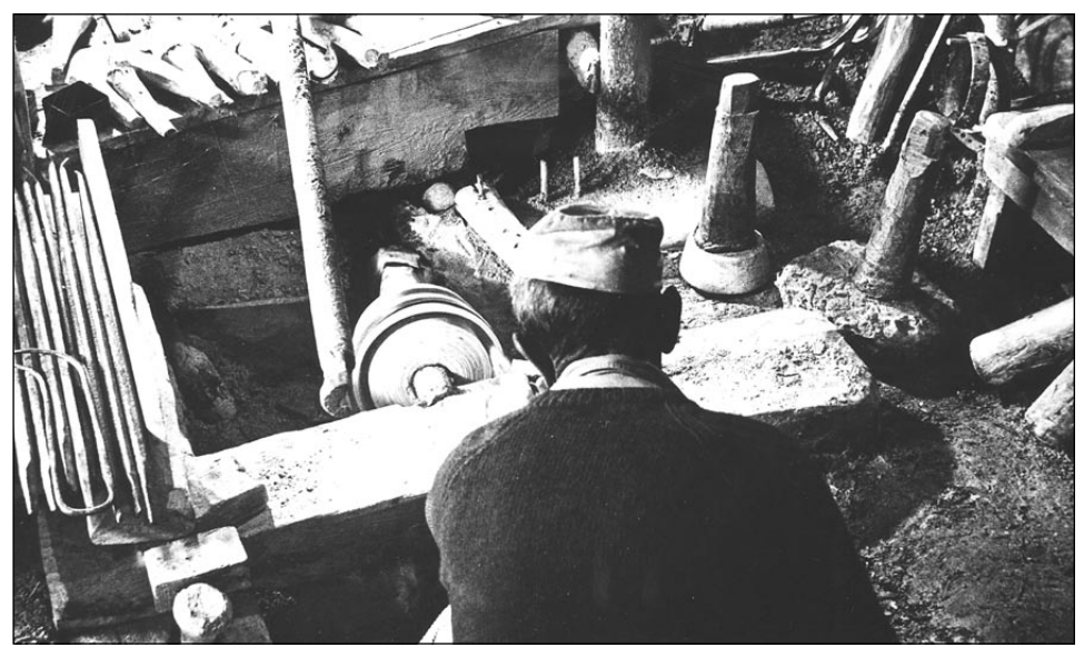
Figure 2. The artisan is working on a water-powered turning lathe.