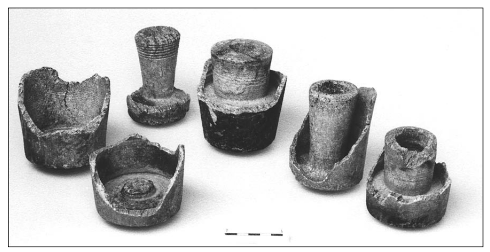
Figure 4. Some spoiled conical cups from the castle of Norantola, Grisons, 14th or 15th century.

As in the continual technology of soapstone production, almost nothing changed until the early twentieth century, and as soapstone vessels – unlike pottery – were not subject to changing fashions, the traditional types and profiles remained the same (Boscardin 1975:11–13). In other words; it is very difficult to suggest a reliable typology and dating for soapstone vessels based on their shape. As they were expensive items already in the Middle Ages, they were used with care and fixed again and again with pitch and wire (Lurati 1970:28, Mantovani 1992:61–63, Boscardin 2001:159).