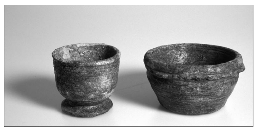
Figure 5. Soap stone vessel and chalice, 9th/10th century, San Murezi church in Tomils, Grisons.

At an emergency excavation in the church of San Murezi in Tomils, Grisons, a small soapstone chalice and a soapstone vessel from the ninth/tenth century were discovered (Jahresberichte 1996:131–132). Such finds show how highly soapstone was valued.