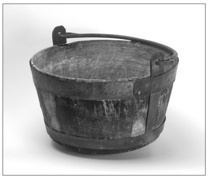
Figure 6. Large cooking vessel from the workshop in San Carlo, Val Peccia Ticino, about 1800. The iron bands have been replaced once.

In the Middle Ages, an important production centre was established in the small town of Plurs (Piuro) near Chiavenna, Italy. In the summer of 1618, a mountain slide destroyed the locality, whose wealth was built on the production and marketing of soapstone vessels ( ibid .:158). In the 1960s, The Swiss National Museum in Zurich organised an excavation in Plurs (Piuro). The results suggest that workshops had been in use since the thirteenth century. Unfortunately, the results have not been published and consequently scientific descriptions as well as many objects are lost forever. Fortunately, the small local museum of Piuro has saved some important objects (Scaramellini 1988:30–48).