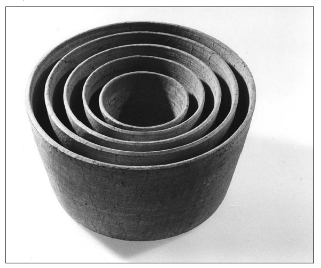
Figure 3. Several (in this case five) vessels are worked out of one single raw piece of soapstone.

The turning of the vessels proceeded from outside to inside, like peeling an onion. Out of a soapstone cylinder it was not only possible to turn one new vessel, but out of its core, a new smaller vessel could be turned. Thus, it was possible to produce up to eight vessels from one large raw piece. The cores, by the way, were not thrown away, but used as cobble stones or weaver's weights (Lurati 1970:15 - 24, Heyer-Boscardin 2002:181).