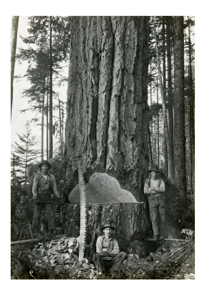
LF.38826, Loggers cutting down a cedar tree, undated.