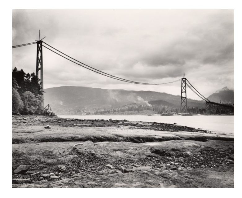
LF.02722, Lion's Gate Bridge mid-construction, undated.