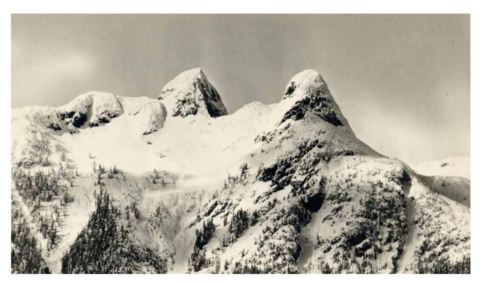
LF.01303, The Lions, scenic collection, 1920.