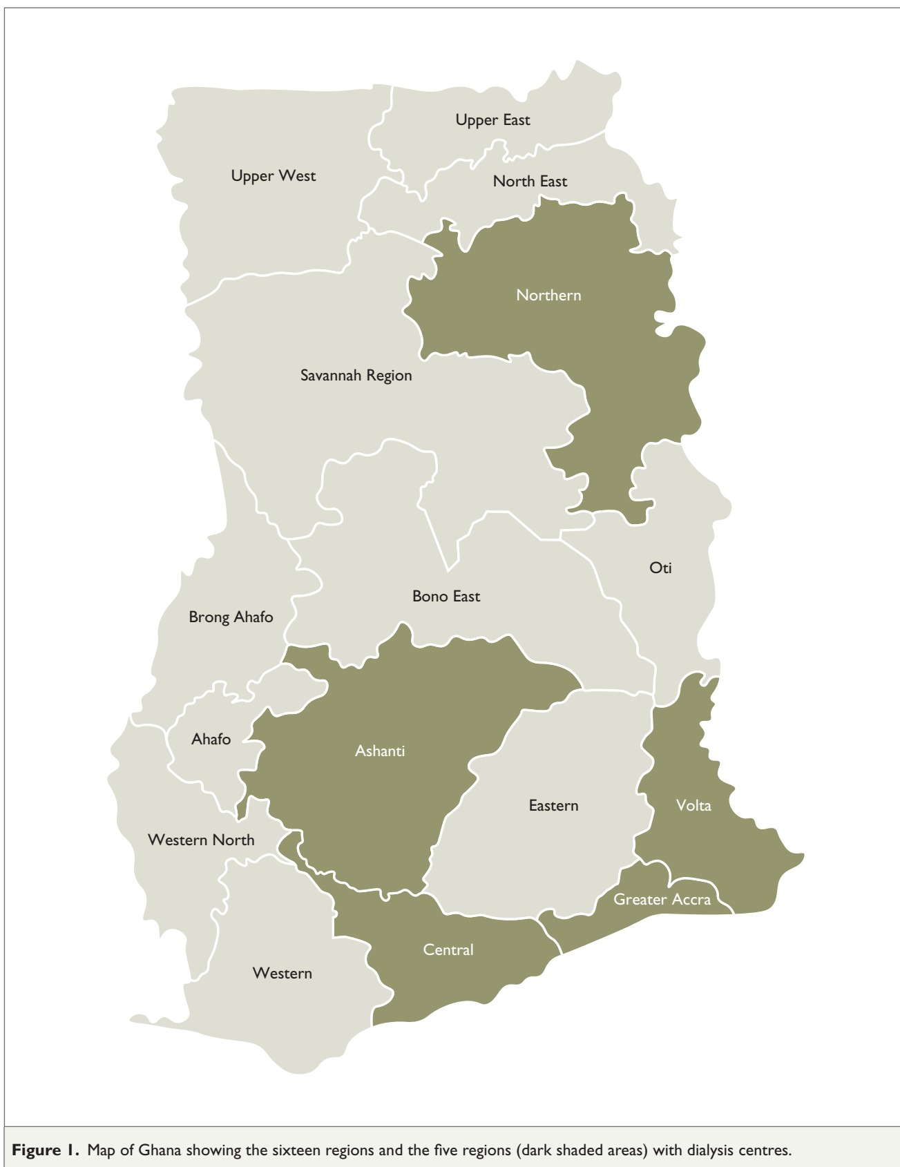
Figure 1. Map of Ghana showing the sixteen regions and the five regions (dark shaded areas) with dialysis centres.

generally young, with a median age of 45.5 years (IQR 33.6–55.6 years). The age distribution is shown in Figure 2. Female patients were younger than their male counterparts, with median ages of 41.6 years (IQR 29.1–54.6 years) and 46.8 years (IQR 37.2–56.4 years), respectively. The median