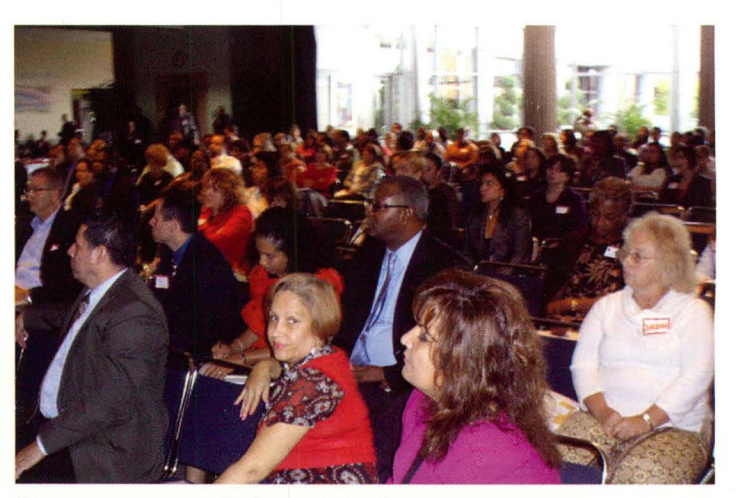
Plenary session at the Rochester Latino Summit.