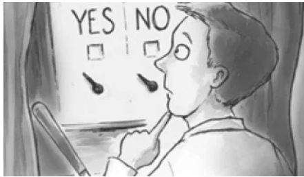
New York's Constitutional Convention Vote: Hit or Stand?