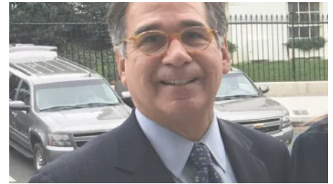
New York State's Congressional Delegation May Lose Two Members

December 29, 2020 In "Election Data Service"