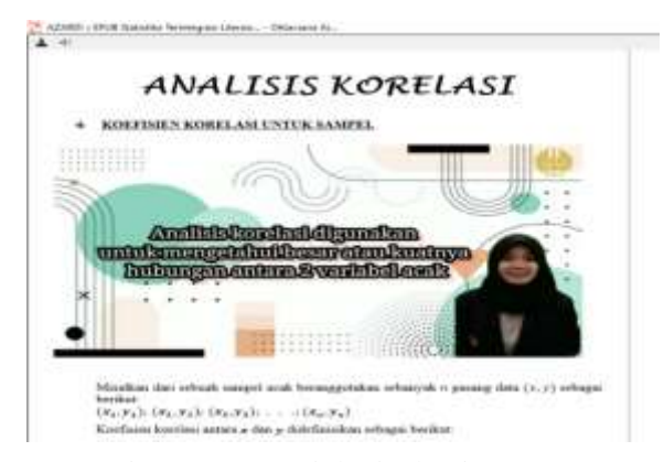
Figure 3. Material Display in EPUB