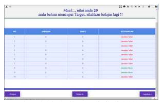
Figure 4. Evaluation Results in the EPUB