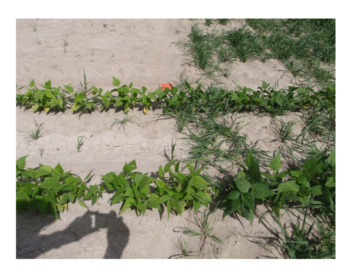
Fig. 2. Picture taken in 2009 showing that beans planted in monoculture appeared more chlorotic than those in grass intercropped plots.