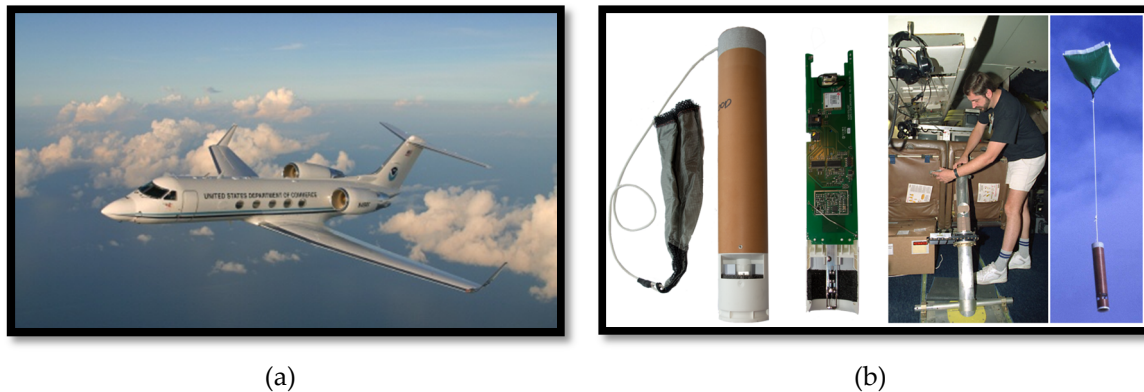
Figure 1. (a) Gulfstream IV-SP (G-IV) [96]; (b) GPS Sonde and Launch [97].

In the early 1970s, the National Center for Atmospheric Research’s (NCAR’s) Atmospheric Technology Division developed the first Omega-based dropwindsonde [94]. Nearly 26 years later, NCAR developed the Airborne Vertical Atmospheric Profiling System and began testing by fall [95]. Simultaneously, the National Oceanic and Atmospheric Administration’s (NOAA’s) Aircraft Operation Center acquired the Gulfstream IV-SP (G-IV) for weather reconnaissance research missions to foster meteorological data from impending hurricanes. In 1997, the Tropical Prediction Center, currently the U.S. National Hurricane Center (NHC), released almost 200 of NCAR’s enhanced Global Positioning System-based dropwindsondes (GPS sondes) from the G-IV in the vicinity of three hurricanes (Figure 1).