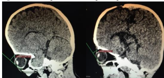
Figure 2. Left side is preoperative longitudinal orbital projection and right side is postoperative measurement. There was decreasing value after advancement.