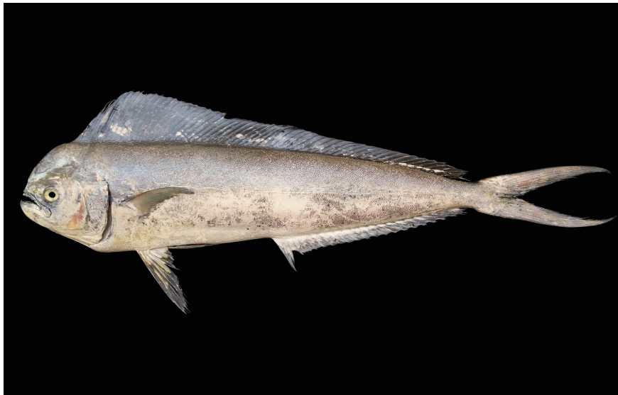
Fig. 1 - Coryphaena hippurus , 762 mm TL collected from the marine waters of Iraq.

One specimens of C. hippurus (Fig. 1) was collected from the Iraqi marine waters at the north-western corner of the Arabian-Persian Gulf (29° 47' N 48° 43' E) on August 2018 (Fig. 2). The specimen was among the catch of a small trawler operating in the marine waters of Iraq. Morphometric were determined using dial callipers and meristic details were recorded following the method described by COLLETTE (1999) (Table 1). The specimens are deposited in the fish collection of the Marine Science Centre, University of Basrah, Iraq (MSCB3245).