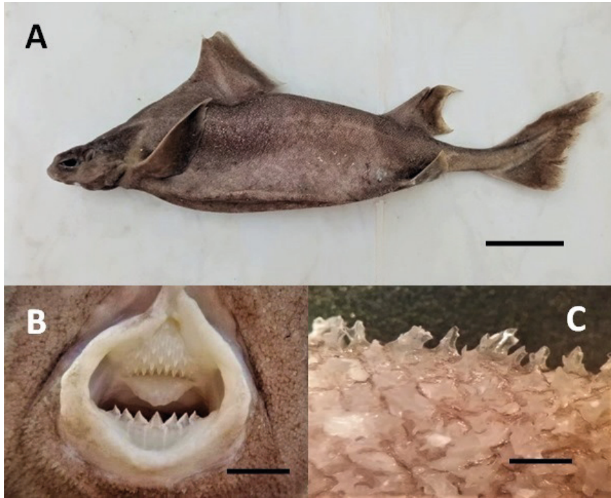
Fig. 2. - A. General morphology of the specimen of Oxynotus centrina (ref. (ref. ISP-AB-Oxy-cent-01) caught off Ras Jebel, scale bar = 70mm. B. Jaw of the same specimen showing upper and lower teeth., scale bar =10mm. C. Denticles removed from the dorsal surface of the same specimen, scale bar = 2mm.

centrina caught in the Tunisian waters are given in Table 1, and for each measurement, we have calculated percentage of TL. They are similar to those recorded by MEGALOFONO and DAMALAS (2004) for the Aegean Sea. Additionally, dental formula and colour are in total agreement with TORTONESE (1956), COMPAGNO (1984), QUÉRO (1984) and EBERT and STEHMANN, (2013).