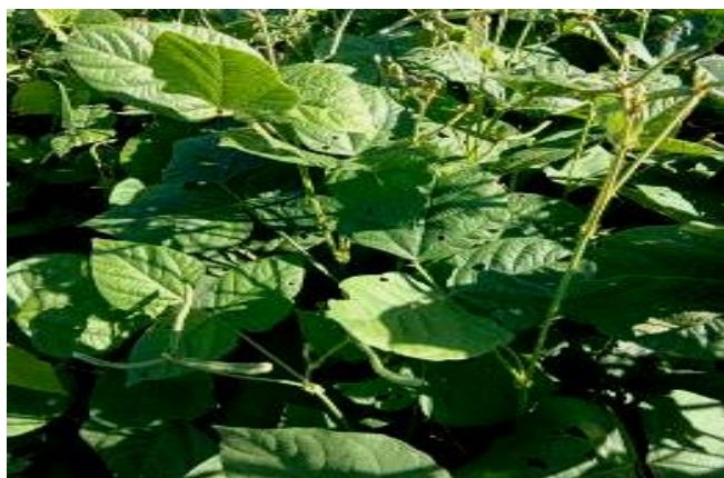
Figure 12 shows one example of Vigna Radiata L growth of initial variety on age 52 days after planting