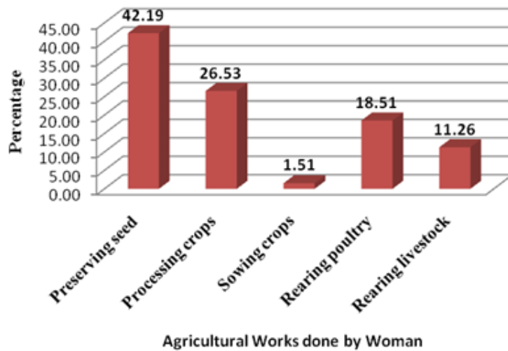
Figure 1. Women involvement in agricultural works