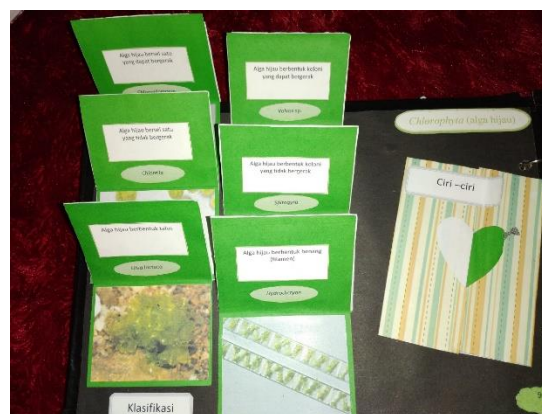
Figure 2. Scrapbook Media Contents

The learning process was carried out in 3 meetings. In the first meeting, students were given material about the characteristics of protista in general, grouping of protista, and mushroom-like protista. In the second meeting, students were presented with material about plant protista, and in the third meeting, students studied material for animal-like protista and the role of protista in everyday life.