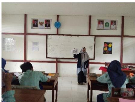
Figure 4. The learning process for the control class using image media

In the control class, the learning process is the same as in the experimental class, only the division of student study groups after the teacher presents the material and the learning media used is different, namely the image media. The use of image media during control class learning can be seen in Figure 4.