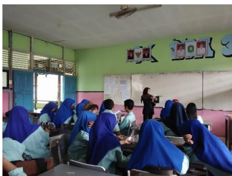
Figure 3. The learning process of the experimental class using scrapbook media

in the scrapbook media and the written Student Worksheet which is distributed by the teacher in groups. In the results of research by Muhadzir and Plung (2013, p.34) stated "learning media with scrapbooks can improve relationships and satisfaction with learning outcomes". Learning is continued by evaluating. The teacher provides reinforcement from the results of group presentations and distributes evaluation questions to each student. After evaluating the teacher gave an award to the group that had presented the results of the discussion in the form of applause. The use of scrapbook media in the experimental class learning process can be seen in Figure 3.