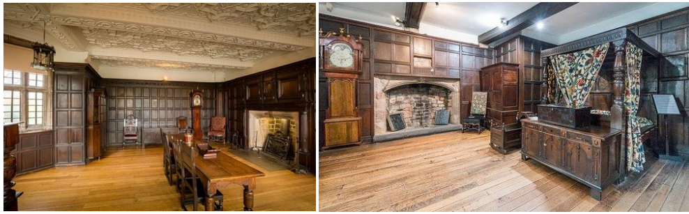
Figure 9. Interiors of the Hall i' th' Wood building in Bolton [19]

The wooden frame of this building, in addition to the usual “Christmas trees” and a lattice with right angles, and “cubes” inside the intersections; it is set out by the curved shapes of double “waves”, double circles with crosses in the middle, and wing-like elements resembling clubs; and cross-type patterns, such as a dark-brown snowflake with 4 foils in the center of a white square. It is noteworthy that on the roof of the building the silhouettes of four chimneys placed in a row, laid out of brick with decorative masonry, are emphasized. This cottage has preserved some interiors; you can see a fireplace, carvings of ceilings and stairs, wood panels, and wooden furniture with wooden canopy [109-111].