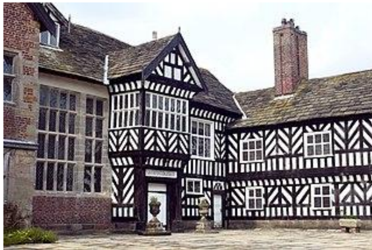
Figure 2. Edlington Hall Cottage at Edlington, Cheshire (the construction of 1480-1505, 1581) [12]

One of the earliest is the half-timbered cottage Edlington Hall at Edlington in the ceremonial county of Cheshire. It is reliably known that the oldest part of the house here was erected between 1480 and 1505 years (the Tudor period), and the east wing was completed in 1581 (the Elizabethan period) (Figs. 2-3).