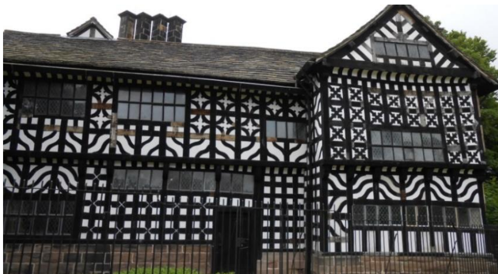
Figure 8. Tudor Time Building Hall i' th' Wood in Bolton [18]

Sometimes, facades, like Dutch, German or Swiss, were equipped with built-in “mechanisms” that attracted attention to a particular house and showed resourcefulness of the owner, who was ready to please and entertain guests and onlookers [104-107]. At the same time, the elements of decorative wooden frames and an attic flooring as a kind of console often appeared outside the facade, sometimes a landscape with a geometrically verified layout and a small garden echoed these details, sometimes even small fountains have spread. One of the most “decorative” half-timbered buildings (or rather additions such as several two-storied wings) of the Tudors period is the Hall i' th' Wood building on Green Way and a part of Crompton Way Avenue in Bolton, ceremonial county of Greater Manchester [108] (Figs. 8-9).