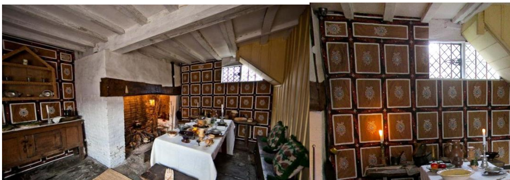
Figure 7. The living room of Shakespeare's family house with an ensemble of the coffered wall panels and sideboard doors [17]

Sometimes, facades, like Dutch, German or Swiss, were equipped with built-in “mechanisms” that attracted attention to a particular house and showed resourcefulness of the owner, who was ready to please and entertain guests and onlookers [104-107]. At the same time, the elements of decorative wooden frames and an attic flooring as a kind of console often appeared outside the facade, sometimes a landscape with a geometrically verified layout and a small garden echoed these details, sometimes even small fountains have spread. One of the most “decorative” half-timbered buildings (or rather additions such as several two-storied wings) of the Tudors period is the Hall i' th' Wood building on Green Way and a part of Crompton Way Avenue in Bolton, ceremonial county of Greater Manchester [108] (Figs. 8-9).