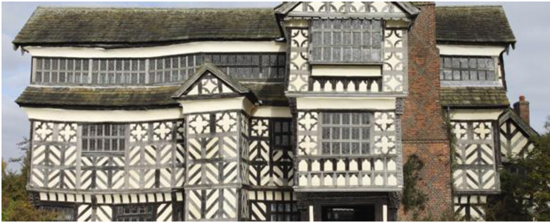
Figure 15. Little Moreton Hall. Another facade of the Tudor days with a long gallery under the roof and decorative masonry chimneybreasts with blue brick [13]

Some superstructures of the glazed galleries of the upper floor of Little Moreton Hall, by their weight, caused the curvature of the walls and made the lower floors to bow and warp. The decoration of the attic gables, with winglike cross-linked images, complements the building's image system and corresponds to several mannerist-like Northern Renaissance walls with a golden "coffered" decor and somewhat rude paintings on dry plaster in the style of plot miniatures of handwritten books on the theme of the apocryphal legend of Susannah (Protestant themes) in the Great Hall (a living room) [32].