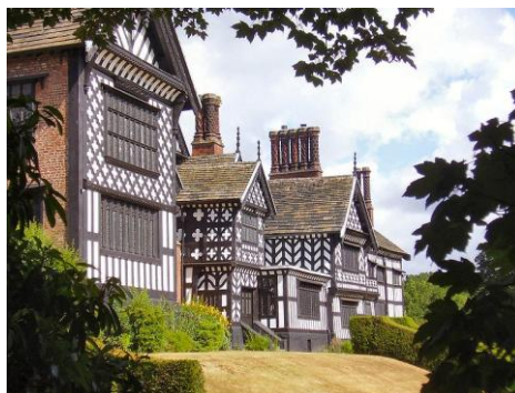
Figure 10. Tudor Manor Bramall Hall (the construction of 1450-1505, improving the image of the building – the 16th-17th centuries; Bramhall Village, ceremonial county of Greater Manchester, Stockport area) [20]