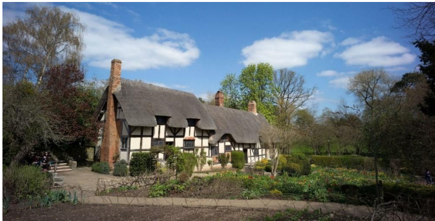
Figure 6. The house under the thatched roof of the family of W. Shakespeare's wife near Stratford [16]