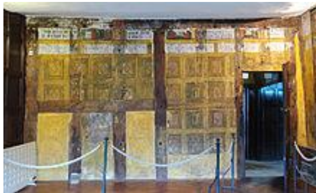
Figure 16. Little Moreton Hall: the wall with golden "coffered" decor of panels and paintings on dry plaster in the style of plot miniatures of handwritten books in the Great Hall (a living room) [26]

Some superstructures of the glazed galleries of the upper floor of Little Moreton Hall, by their weight, caused the curvature of the walls and made the lower floors to bow and warp. The decoration of the attic gables, with winglike cross-linked images, complements the building's image system and corresponds to several mannerist-like Northern Renaissance walls with a golden "coffered" decor and somewhat rude paintings on dry plaster in the style of plot miniatures of handwritten books on the theme of the apocryphal legend of Susannah (Protestant themes) in the Great Hall (a living room) [32].