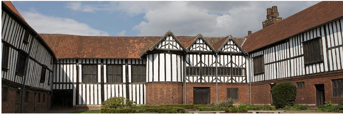
Figure 1. Gainsborough Old Hall in the ceremonial county of Lincolnshire the construction of the latter half of the fifteenth century) [11]

One of the earliest is the half-timbered cottage Edlington Hall at Edlington in the ceremonial county of Cheshire. It is reliably known that the oldest part of the house here was erected between 1480 and 1505 years (the Tudor period), and the east wing was completed in 1581 (the Elizabethan period) (Figs. 2-3).