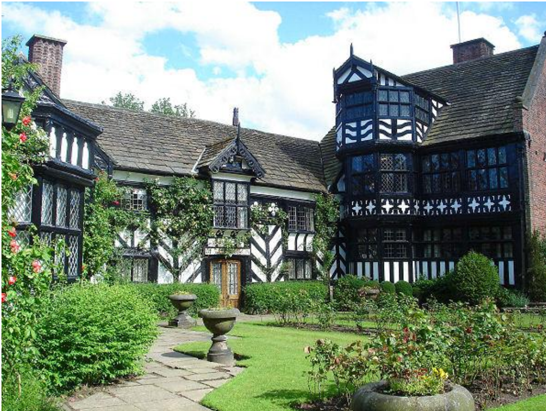
Figure 4. Gawsworth Old Hall, Church Lane, Gawsworth, ceremonial county of Cheshire [14]

watch and a compass of a later time. Now in the building, as a monument of architecture, there is a museum (similar museums were created in numerous half-timbered buildings of that period, say [96], like Blakesley Hall in Birmingham in the ceremonial county of Worcestershire, 1590, where various wall panels have been preserved (Figs. 4-5).