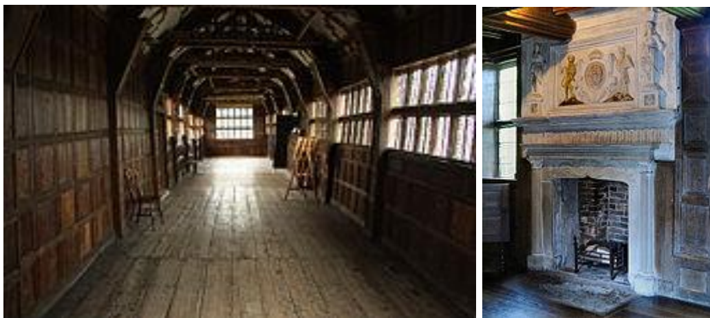
Figure 14. Little Moreton Hall, the interior of the Long Gallery. Fireplace in the Parlour with plasterwork overmantel displaying the royal arms of Queen Elizabeth I, circa 1559 with Caryatids on either side [25]