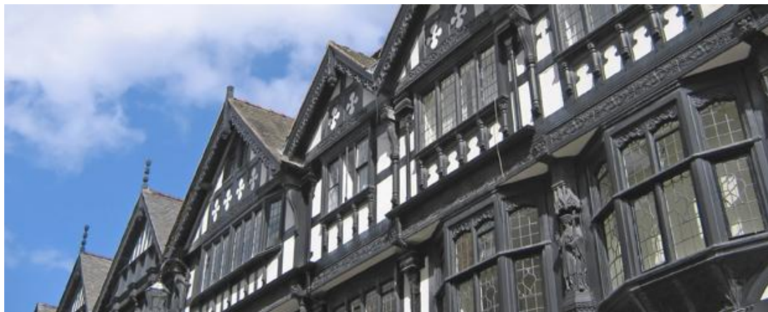
Figure 3. Cheshire cottages of the Tudor era; in the foreground is the facade of the building with sculptural elements that appeal to the traditions of Gothic carvings [13]

Among the earliest half-timbered buildings of England in the ceremonial county of Cheshire, one should also mention Gawsworth Old Hall, located in the countryside near Macclesfield. It was reduced during the years 1480-1600 and is an example of early Tudor-Elizabethan architecture [92-95]. In it, in addition to decorative elements of the facade with figured bay windows and stained-glass windows, the structural and ornamental decoration of which consists of motifs of “trees”, parallel stripes, “bowling pins” (a la silhouette of a human figure) and the elements of the “spade” type, there are preserved lateral chimney pipes and furnishings – a