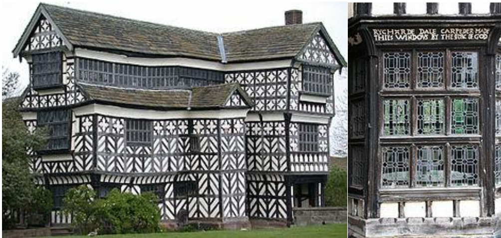
Figure 13. One of the parts of Little Moreton Hall, also known as Old Moreton Hall, in Cheshire, England. It was constructed in the mid-16th century [23; 24]

In Little Moreton Hall, the outer plan was resembling a rectangle; it looked like a square with a cloister. Two of the three floors in some parts looked like “birdhouses” connected angle-wise on the arms of the cross. In the house, there is a wardrobe, a large refectory table, and also in one of the bay windows – an octagonal table. The interiors of the mansion, which had large territories, expanded during the Dissolution of the Monasteries, and stood on an island, were described in Inventory 1599, in which the presence of a round table was noted. The author of the magnificent bay windows of this building was Richard Dale [76]. The furniture was echoed by the rhythm of the oak panels with which the walls and the attic of the galleries were covered. The patterns of these decorations appealed to the mystical signs of the fraternity of Freemasonry and were compatible with the plastic decor in separate rooms. The leaded windows of the building are formed by leaded panes, set in patterns of squares, rectangles, lozenges, circles and triangles, reflected in shades of green, yellow and lilac colors due to the admixture of metals and decorations on a timber frame. Some rooms have stained glass windows, the pattern of which resembles four faceted emerald-shaped stones with diamonds in between (Figs. 13-15).