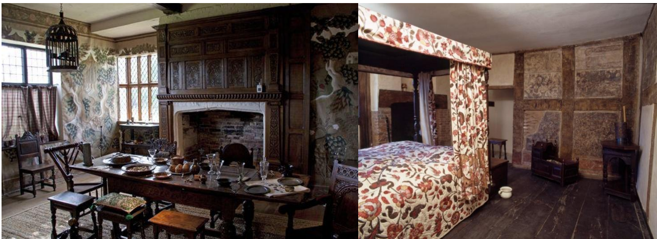
Figure 5. The interior of the half-timbered house of the layman in Blakesley Hall in Yardley, Birmingham, in the ceremonial county of Worcestershire, 1590 building, where carved wall panels and elements of furniture and decoration of the 17th century are preserved [15]

A well-known example of the early Renaissance British half-timbered architecture is the Feathers Hotel, the Bullring, Ludlow, (the ceremonial county of Shropshire, not far from the border with Wales), with Renaissance twin arches and carved ornaments on the peak of gables, cruciform elements and bas-relief sculptural heads on the facades of the walls [97-103], bay windows of the second or third floors, the honeycomb-like (diamond) patterns of stained-glass windows (the modern look – the restructuring of the early seventeenth century based on the facade of the previous period) and tiles. It looks quite “urban” compared to the “village” house under the thatched roof of Shakespeare's family in Stratford-upon-Avon (Figs. 6-7).