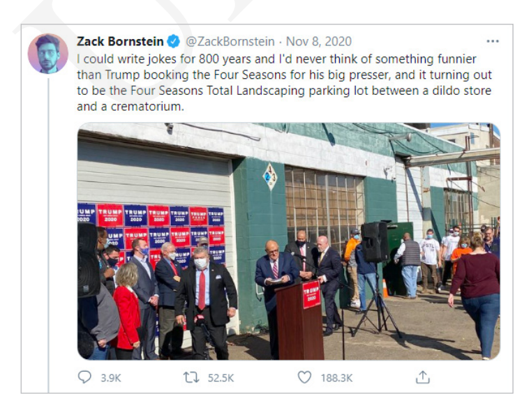
Fig. 4: A photograph of Trump's press conference, commented on by @ZackBornstein

Another way Trump's loss of the election was celebrated in meme-format occurred in the form of event references, such as the slow vote counting in Nevada (e.g. Haylock 2020) or in response to Trump's final press conference. After it was announced that he would be giving a press conference not in the Four Seasons hotel but Four Seasons Total Landscaping parking lot, many memes were created that alluded to this event.