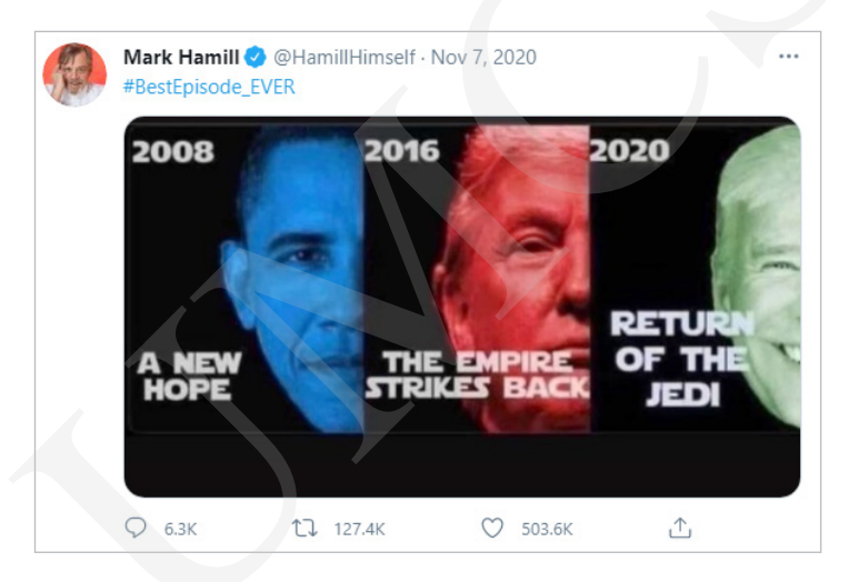
Fig. 2: The titles of the original Star Wars trilogy imposed on the American presidents from 2008 to 2020 (@HamillHimself, 2020).

Hence allusions to popular movies and TV shows form the base of many memes framing the weeks of the election week. Particularly references to such staples of geek fan culture as Star Wars , Marvel , and Game of Thrones were abundant, with even Mark Hamill, the actor playing Star Wars 'Luke Skywalker, sharing a highly popular meme after the election that was liked 500k times: