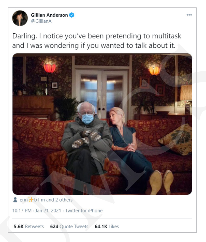
Fig. 6: Celebrities such as actress Gillian Anderson contributed to election memes spreading, sharing variations of "Bernie's Mittens"

depicted as "'cool' and culturally informed both in memes and ... fan writings" (2020) which are widely created and shared. This relatable image soon lost all political significance, becoming seemingly a floating signifier without clear meaning or reference. The iconic photograph of Bernie in his mittens was inserted into anything – from pop cultural imagery such as the Totoro meme<sup>6</sup> to the NASA rover landing – and reproduced in many media, be it deep faked video clips or as a crocheted doll.