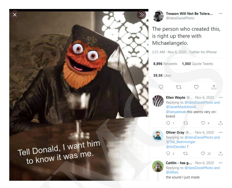
Fig. 3: Example of Gritty meme with high intertextuality by @IskraDavidPhoto (2020)

While the framing is similar to the previously discussed examples, in memes such as this<sup>3</sup>, several elements come together to create the multi-layered joke of the meme: Gritty's head is super-imposed on Olenna Tyrell, a character from HBO's Game of Thrones series. The show's quote is slightly altered to refer to Donald Trump, once again taking the place of a hated villain, this time Game of Thrones ' king Joffrey. Denisova (32) points out that "memes are coded messages and therefore can be confusing for various people: members of the audience may have varying abilities and skills to read the 'code'" in such cases. Here it is both necessary to know the context of the quotes – Olenna admitting to the murder of a tyrant king – and the event it references, with the implied metaphorical murder being Trump's loss of the election, which was attributed to the votes of leftist Philadelphians, as Pennsylvania flipping blue was seen as the key event cementing Biden's victory, metonymically referenced through Gritty.