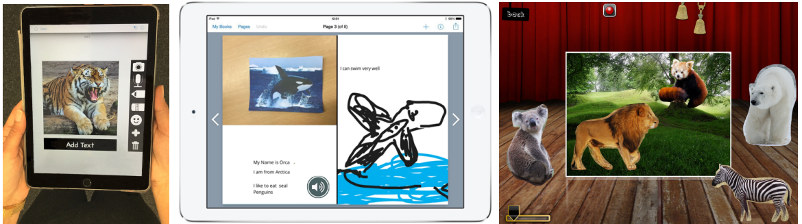
Note . Creating a vocabulary card with BitsBoard (left), a lexicon entry with Book Creator (middle) and an animated role play with Puppet Pals (right)

In a subsequent step, the learners create a simplified lexicon entry of an animal of their choice with the app Book Creator. It is important to note that this entry is simplified (by using the first person singular in describing the animal and only mentioning a few facts about it), but it still adheres to the main genre conventions of a lexicon entry – that is, it uses a picture, mentions the name of the animal and key facts about it (e.g., habitat,