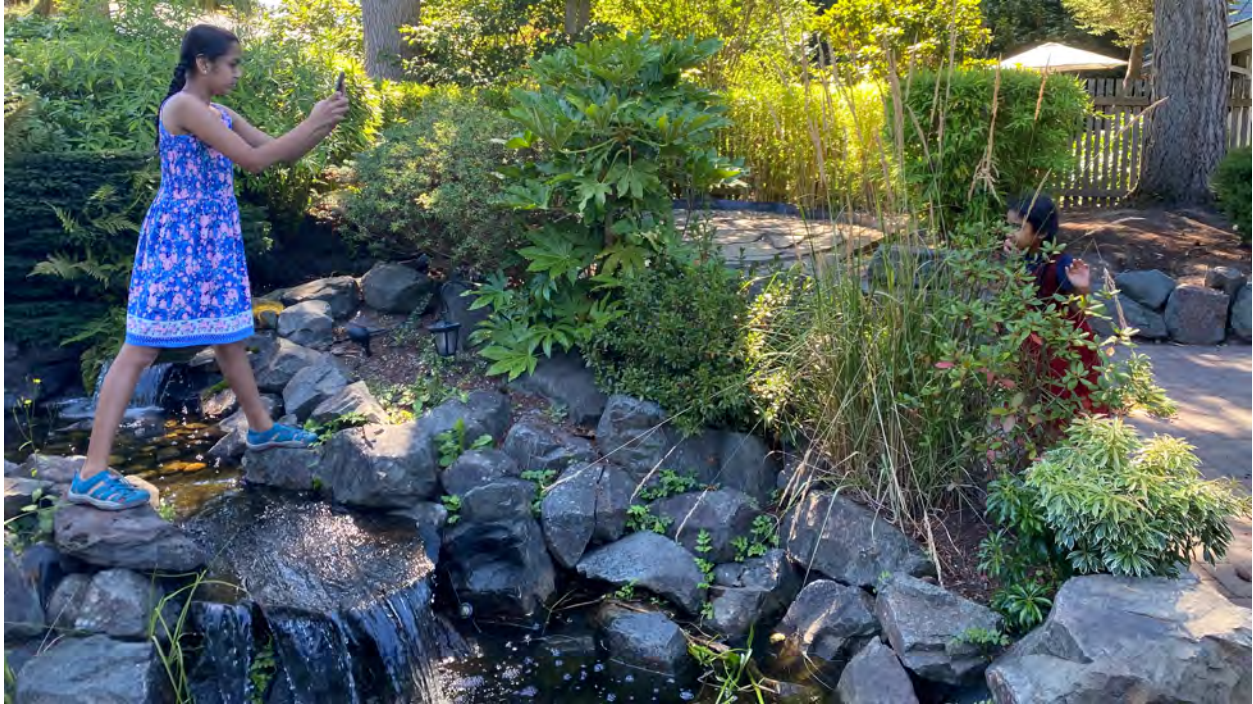
Improvising 'tiger' habitats, May 2020

collapsed, distorted, elongated, or crooked and panned the frame to clone the characters (dolphin, vulture, tiger) into multiples. Tilting the phone to change the perspective of the image was another area of experimentation. She decided to use the panorama feature (without the add-on 360° app) based on the fact that it allows for a variety of modulations. In her words, "When I tilt, I think of the iPhone like a magical machine and it lets me take pictures that are always changing. The photos can be moved, cut, copied, colored, given effects, made into an iMovie or one long attached picture for telling the stories I want. I can even tell a story in many different ways."