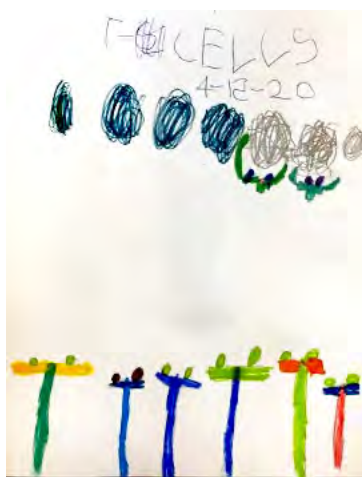
Final drawing of T-cells by my 5-year old, April 2020.

I explained that, "just like the digestive system helps you eat yummy food, get vitamins and make energy for playing all day, the immune system keeps you safe and fights bad germs." I encouraged her by asking if she would like to draw or maybe dance out what she learnt. I asked, "Can you tell me what characters we need to have for this drawing?"; she would pick herself, a germ, and the immune system. Then I would break down the immune system into smaller components such as a T-cell which would give me an opportunity to explain the idea of binding sites.