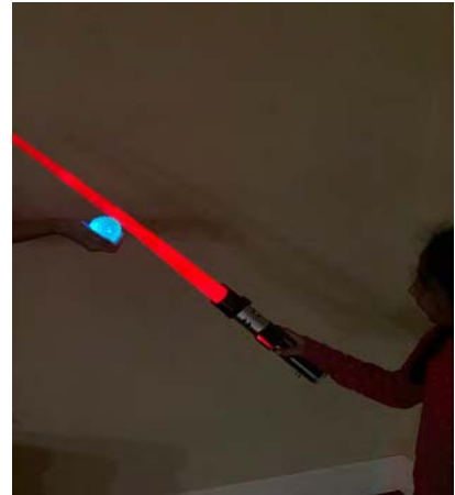
Performing coronavirus and immunity: coronavirus light-up balls and T-cell light sabers, April 2020.

When we perform this with a spiky light-up ball, it is easy to denote 2 states: an initial virus entry into host and the lit-up ball showcasing active viral replication mechanisms inside host.