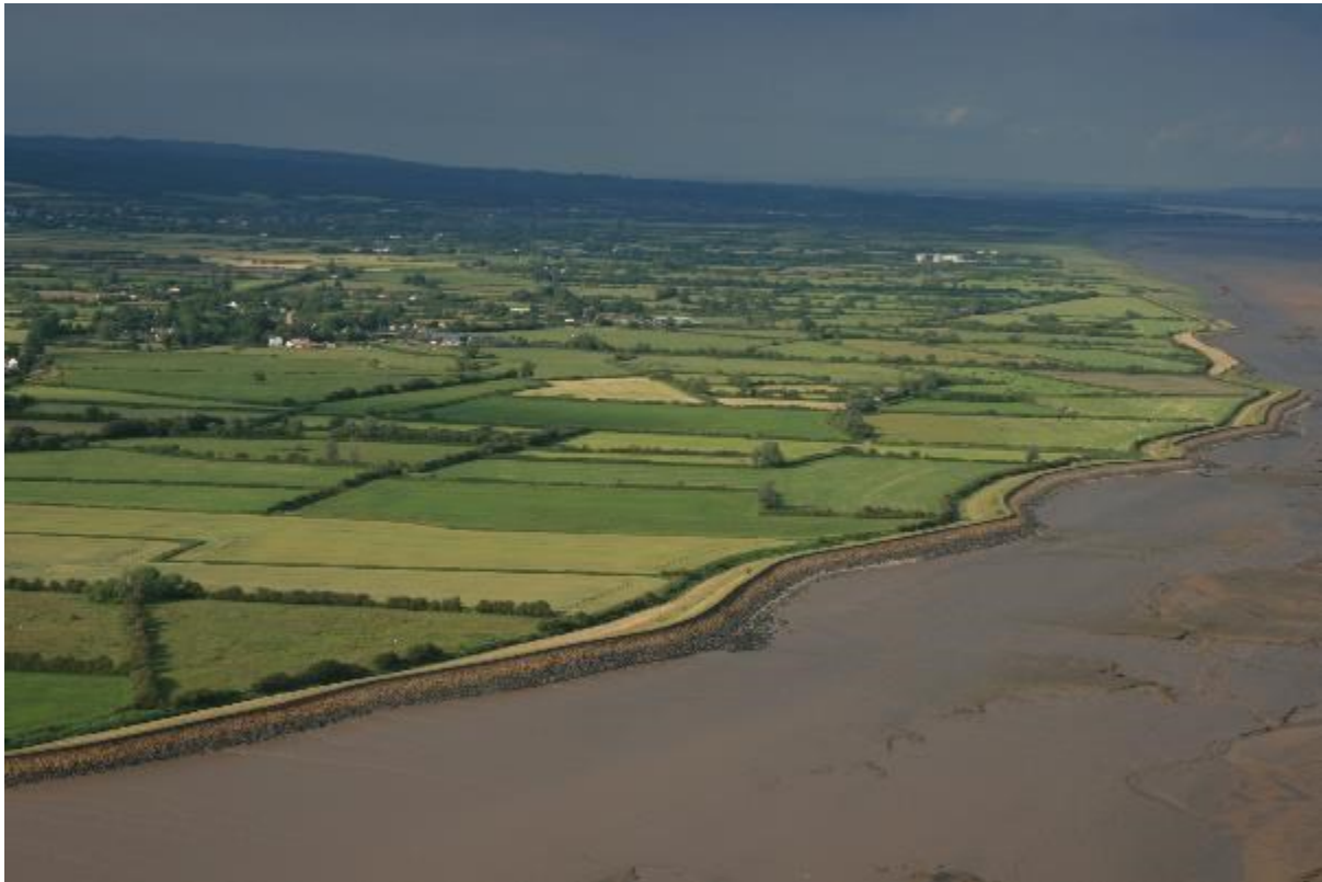
Figure 2. Aerial view of the coastal part of Redwick parish showing how the modern sea wall has been set-back to its present location such that it cuts diagonally across earlier fields (photo: author).