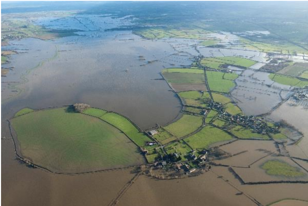
Figure 4. Aerial view of the island and medieval monastery of Muchelney, in Somerset, during the freshwater floods of 2014.

By the 12 th and 13 th centuries the coastal marshes all around the Severn Estuary were mostly embanked and drained, although the lower-lying inland ‘backfens’ were mostly unenclosed common pasture and very vulnerable to flooding from freshwater running off the surrounding high ground (Figure 4). When assessing population densities and agrarian prosperity across different landscapes it is therefore important to differentiate between the permanently settled agricultural lands in the coastal districts, and sparsely or just seasonally utilised backfens. Unfortunately the Gwent Levels are poorly documented in the medieval period, but Somerset has a large number of documentary sources that allow us to compare the wetland and dryland economies. Domesday Book shows that in the late 11 th century the settled coastal claylands of the Somerset Levels had densities of both population and ploughteams that were comparable to the adjacent dryland areas, while for the period 1250-1349 other sources suggest that the reclaimed coastal marshes supported an average to high population density, and a high to very high assessed wealth (Rippon 2021, appendix 2.1 [see top of table for sources used]). Quite simply, although the recurrent costs of maintaining the drainage and flood defence systems on the Levels were high, and there was an ever-present risk of flooding, the high agricultural productivity of these wetlands more than made up for the costs and risks.