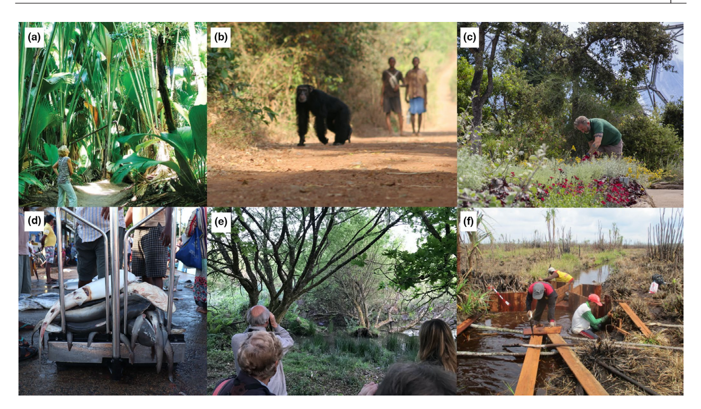
FIGURE 1 A conservation issue highlighted or driven by the COVID-19 pandemic, by case study site. (a) In the Seychelles, international tourism temporarily ceased, meaning a complete loss of funds for many protected areas, including the UNESCO World Heritage site of the Vallée de Mai. (b) Chimpanzees and other wildlife may also be susceptible to the novel coronavirus, creating a possibility of inter-species transmission especially in shared landscapes such as Cantanhez National Park, Guinea-Bissau. (c) The Eden Project, UK, was closed to visitors for 75 days, with estimated revenue losses of up to 5 million GBP. (d) In Sri Lanka, sellers were quick to adapt to lockdown measures, but fishers, small-scale traders and casual workers appear to have been the most impacted by the market changes resulting from the pandemic. (e) The Cornwall Wildlife Trust, UK, raises funds from community engagement events such as this public beaver walk, many of which were unable to occur in 2020. (f) In Indonesian Borneo, conservation actions such as habitat restoration (in this case, the damming of old illegal logging canals in the peat) have been able to largely continue because the work is managed and carried out by small local teams. Where individuals are identifiable, consent has been gained for the use of their photograph for publication

et al., 2012). Some of the most extreme examples involved the widescale destruction of highly diverse habitats via the drainage of wetlands (Olival et al., 2012; Richardson & Hussain, 2006), defoliation of forests (Nguyen, 2009) and the dumping of pollutants into aquatic environments (Lawrence et al., 2015). In such cases, habitats and their associated biodiversity take decades to recover, if they recover at all. Less extreme, but still significant, is the fragmentation and transformation of natural habitats into plantations or farmlands via the migration and settlement of populations displaced by conflict, or the incursion of roads and infrastructure by military or guerrilla groups (Butsic et al., 2015). Once conflict has subsided, the fragmentation of habitats and incursion of infrastructure often makes previously remote areas more accessible, opening up natural resource extraction opportunities and encouraging settlement of previously abandoned or remote areas (Dávalos, 2001; Clerici et al., 2020; Conteh et al., 2017; Enaruvbe et al., 2019; Grima & Singh, 2019).