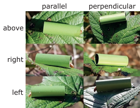
Figure 1. Examples of targets placed in situ in the two orientation conditions with respect to the direction of the sun: parallel or perpendicular. Suitable photographs of targets in situ were not taken during the experiment. These images were obtained at solar noon on 18 February 2021, when the sun is in the same position as on 25 October. Hence, we used the 25 October countershading pattern to make the targets shown in the figure. Given that the colour of bramble leaves differs in autumn and late winter, for illustrative purposes we recalculated the average bramble colour using the same methods and used this to print targets.

Targets were left exposed to predation for ~2 h either side of solar noon. During the experiment, solar noon varied minimally between 11.59 and 12.02 h (www.solar-noon.com); hence, in each block the experimenter began placing targets at 09.40 h, with it taking ~20 min to place all targets out. Mealworm predation was then checked every hour starting on the hour over a period of 4 h (checks beginning at 11.00, 12.00, 13.00 and 14.00 h). At each check, the target was scored as predated if the mealworm had been removed completely or partly. The experimenter assessed whether non-avian predation might have occurred by looking for slime trails left by gastropods or hollow exoskeletons left by arthropods. If the target was not at the expected location, possibly because of disturbance by wind, animals or the experimenter, or because of experimenter error in relocating the target, the experimenter searched thoroughly beneath the expected target location. If the target was found with the pin present but mealworm missing, it was recorded as predated. If the mealworm was still present, it was replaced on the bramble leaf and not recorded as predated. If the target could not be