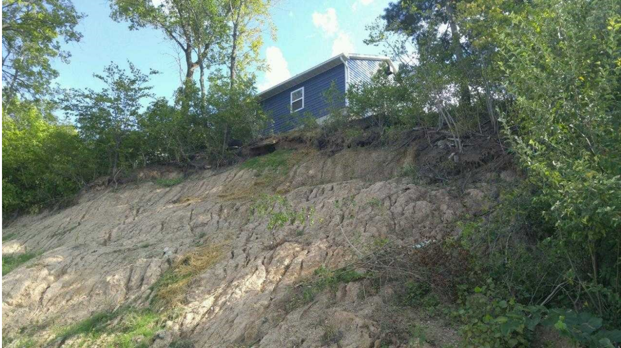
Figure 4. Slope erosion undercutting privately owned garage at Lake Charleston.

The Wisconsin Glaciation period, the most recent one of the Ice Age, created a landscape characterized by a series of subparallel end moraines separated by low relief till and lake plains. Formed by a series of offlapping drift sheets of mostly diamicton that pinch out towards the NNE (Hansel, et al., 1999), the configuration of these moraines reflects the glacial outflow of the Lake Michigan basin as well as the influence of bedrock topographic highs (Johnson and Hansen, 1999). Most of the moraines are true end moraines, being composed predominantly of till and formed at an ice margin during the deposition of the last glacial pulse