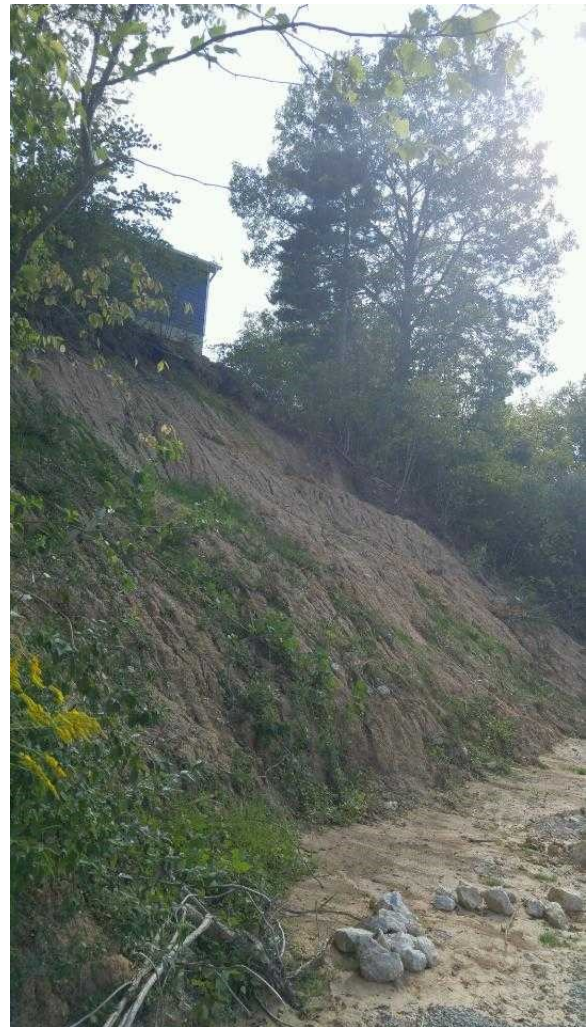
Figure 5. Cut out toe of slope increasing erosion on trail at the lake.

as well as newer, more effective methods of extraction. On most days, the smell of sulfur is strongly detected, a byproduct of the extraction process releasing gases associated with the oil.