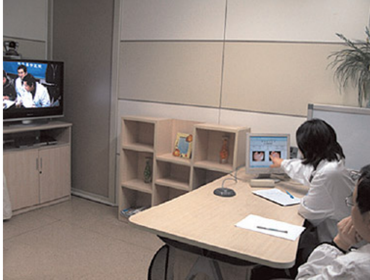
Figure 1: GPs in Zhejiang No.2 People Hospital conducting a teleconsultation with a patient and GPs in Shaoxing Hospital via the Golden Health Network (GHN).