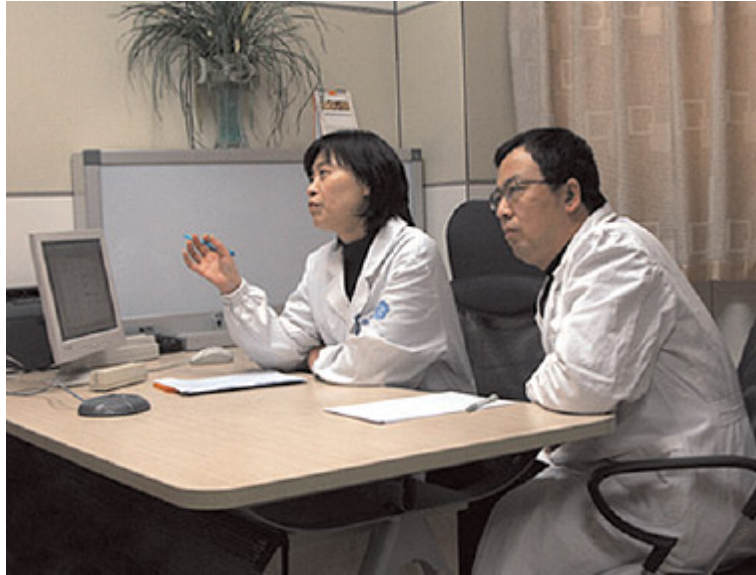
Figure 4: GPs in Zhejiang No.2 People Hospital discussing a case with GPs in Shaoxing Hospital via the GHN.