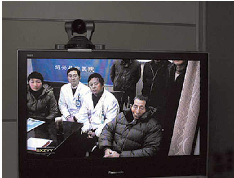
Figure 3: A patient and GPs in Shaoxing Hospital.

All these problems affect the development of telemedicine in China. To solve them, we suggest that the Chinese government needs to make a policy in favour of rural people and invest more in telemedicine, so that they can enjoy low-cost telemedicine services and foster a large telemedicine market. The government also needs to make a uniform health data standard for telemedicine and the standard should take account of the characteristics of the Chinese health-care system and the Chinese language. National telemedicine regulations should be made as soon as possible to regulate telemedicine practices. Doctors should be given more telemedicine training and encouraged to practice telemedicine by introducing appropriate guidelines and rewards. Meanwhile, IT training and telemedicine demonstrations are also necessary for people living in rural areas to gain a basic telemedicine knowledge, change their conventional medical culture and receive telemedicine services (Figures 1-4). Senior managers in Chinese hospitals should give higher priority and more resources to developing telemedicine. A wide alliance including government, hospitals, IT vendors, research institutes and doctors needs to be set up to enhance cooperation with each other, which will speed up the development of telemedicine in China.