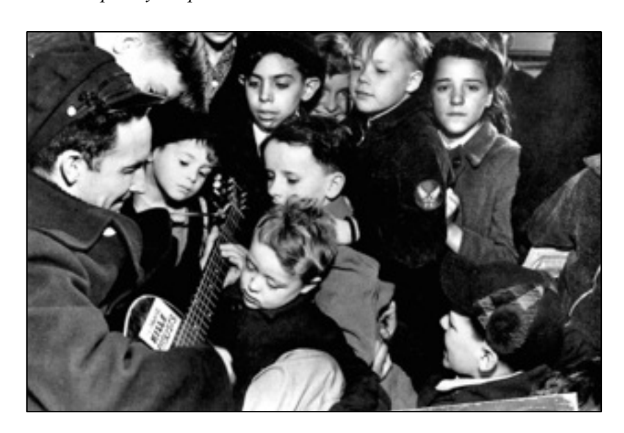
Fig. 2: Woody Guthrie plays music for children in New York, 1943.

His music is deceptively simple.<sup>27</sup>