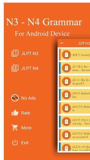
Fig. 3. Menu display of JLPT N3-N4 Grammar for Android Device Application

JLPT N3-N4 Grammar for Android Device is a Japanese language learning application that contains N4 and N3 material. The contents cover grammar according to the learning level and example sentences. JLPT means Japanese Language Proficiency Test. JLPT is a form of test to measure a person's Japanese language skills. The lowest level of Japanese language proficiency is level N5, and the highest level is level N1. Figure 3 to figure 5 shows the application display of JLPT N3-N4 Grammar for Android Device.