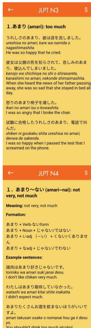
Fig. 5. Content Display of JLPT N3-N4 Grammar for Android Device

The previous section mentioned that interest in using applications is also affected by the application display. We have researched the appearance of the application. There are various kinds of opinions that developers can use to improve the performance of learning applications.