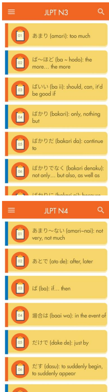
Fig. 4. Sub-menu Display of JLPT N3-N4 Grammar for Android Device

application focuses on grammar. This application also shows examples of using the sentences. Not only one sentence, but there are also many examples. This learning application tends to be more complete and more practical than other learning applications (displayed in Fig. 5).