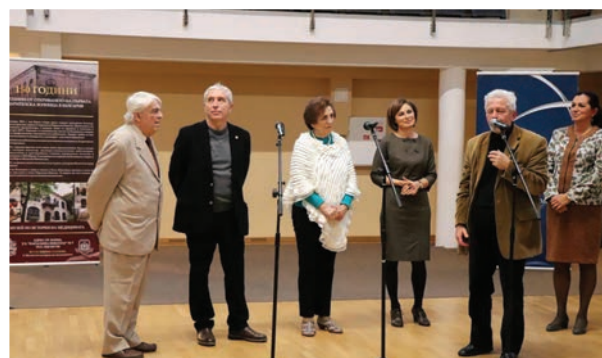
December, 12 th , 2020. Presentation of the author's team of the book: 150 Years of the Establishment of the First Charity Hospital in Bulgaria, 150 Years in Service to the Healthcare in Varna