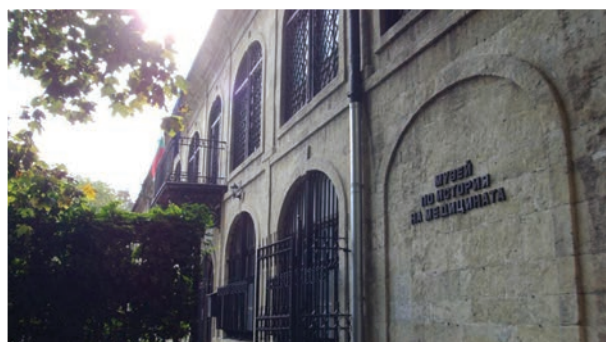
The building of the Paraskeva Nikolau Donation Hospital in Varna, in which today the Museum of History of Medicine in Varna is disposed.

These two buildings have different uses but are related to one another by an important circumstance. Both - the temple St. Nikolay Mirlikiyski Miracle Worker and the Paraskeva Nikolau Donation Hospital were built with the funds bequeathed by the wealthy patriotic Paraskeva Nikolau living in Odessa (Vasilev, Marinov, 2019-b; in Bulg.). They exist until today, they are used according to the will of their donor, they are located in the heart of Varna, and greatly contribute to the unique appearance of the seaside city.