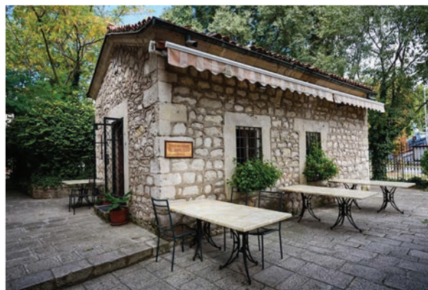
The chapel of St. Prophet Elijah built in year 1836, which is included in the park of Paraskeva Nikolau donated Hospital.