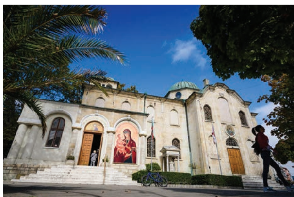
The first sea temple, St. Nicolay Mirlikiyski Miracle Worker, in Varna opened in 1865.