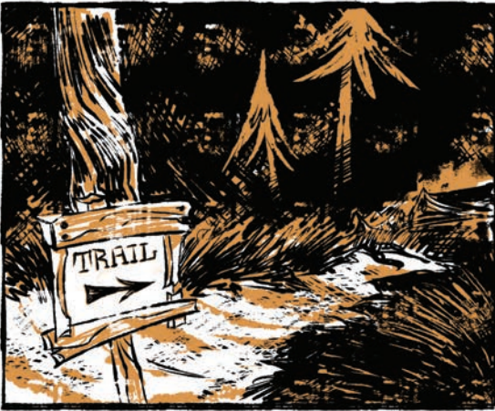
THE ONCE BEATEN TRAIL