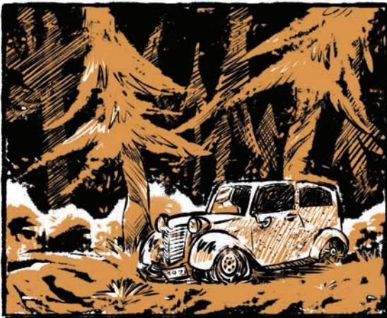
THE JALOPY IN THE WOODS