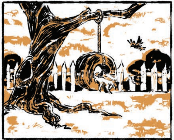
THE OLD TIRE SWING