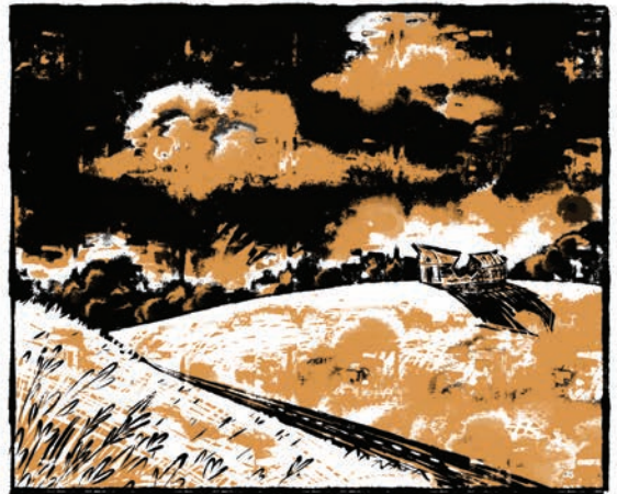
THE CAVED IN BARN