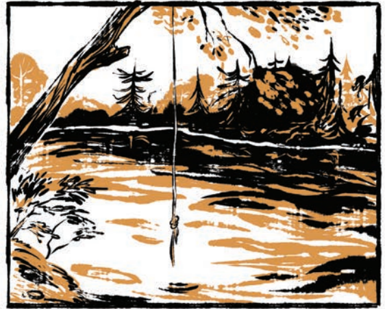
THE ROPE SWING