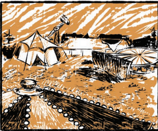
THE FORGOTTEN FAIR