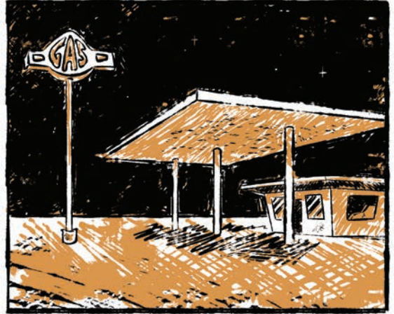
THE GAS STATION