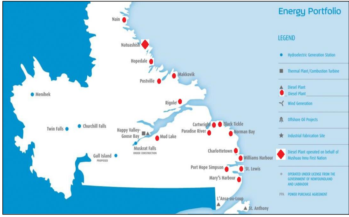
Figure 1: The 16 remote aboriginal communities in Newfoundland and Labrador

structures, future demand expectations, renewable resource availability, as well as provincial plans to support communities' participation in renewable electricity generation.