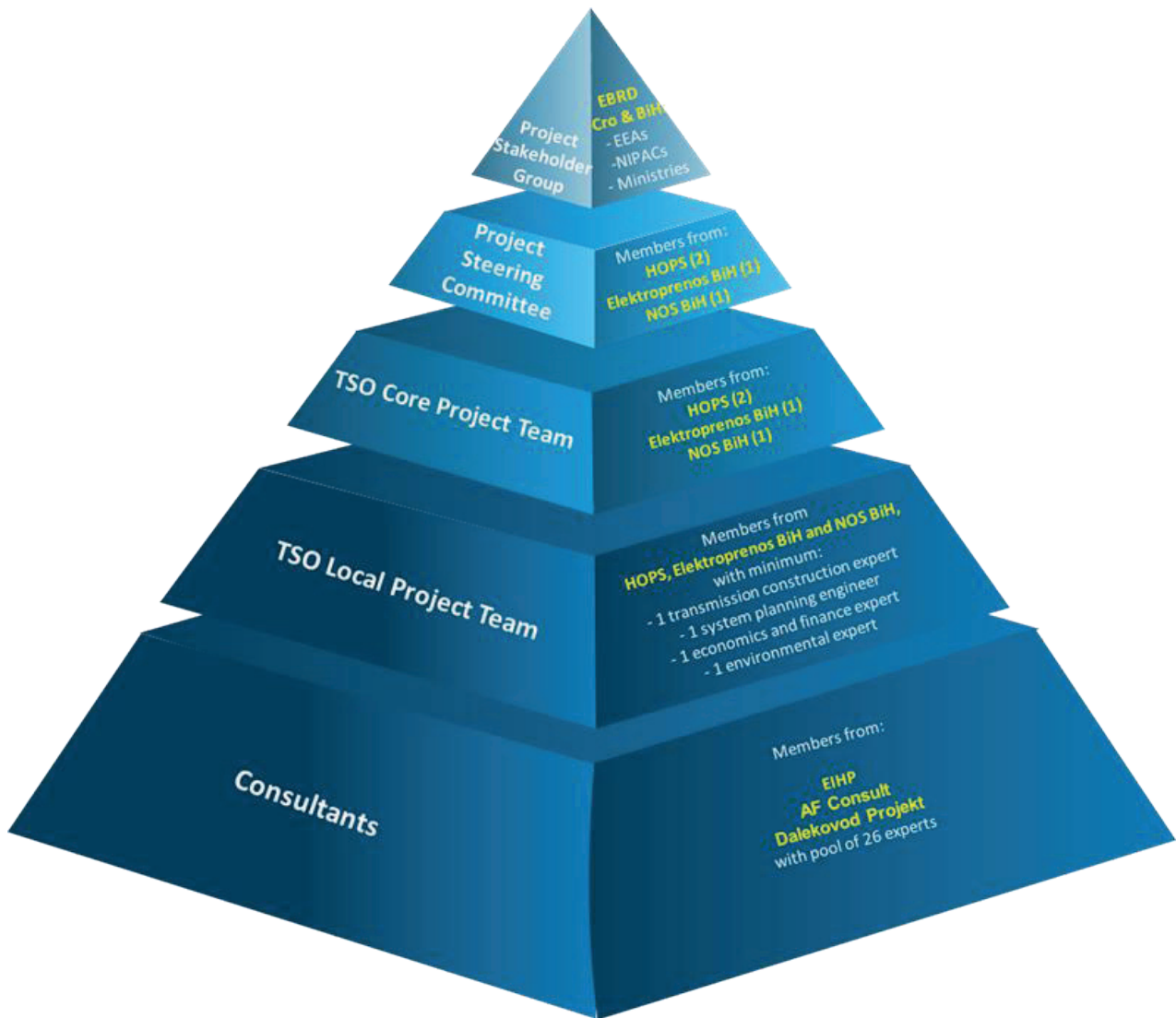
Figure 2: Feasibility study project governance