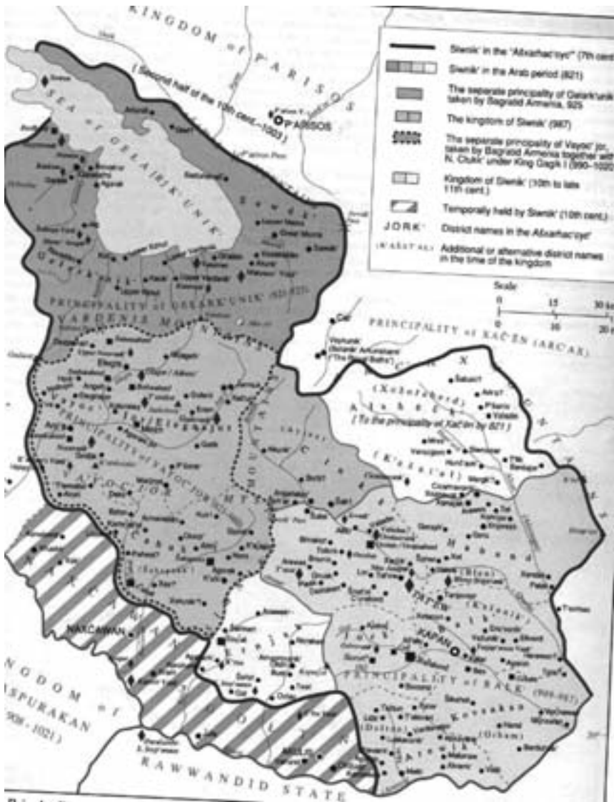
Fig. 1 - from R.H. HEWSEN, Armenia: A Historical Atlas , Chicago-London 2001, map 98.