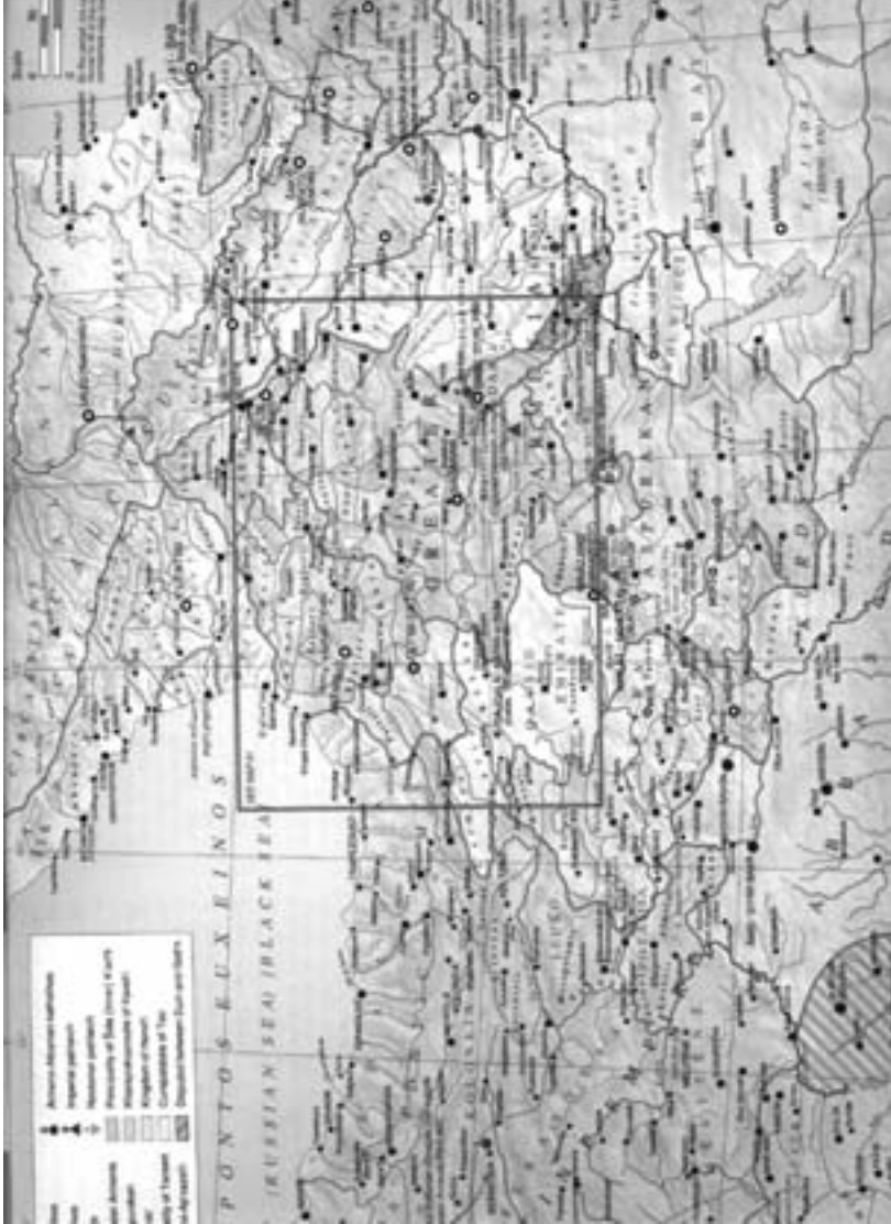
Fig. 2 - from R. H. HEWSEN, Armenia: A Historical Atlas , Chicago-London 2001, map 87.