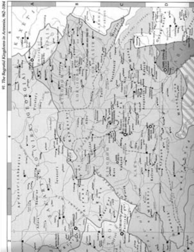
Fig. 3 - from R.H. HEWSEN, Armenia: A Historical Atlas , Chicago-London 2001, map 91.