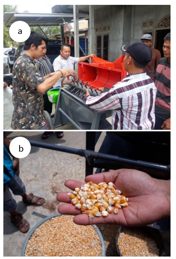
Figure 4. a) Corn sheller machine operation practice; b) Com kernels produced

This constant speed rotation was essential to avoid damage to the corn a fter the shelling process that can be caused by the high moisture content or the exceedingly high cylinder speed. In addition to this demonstration, this activity also provided explanations of how to maintain the corn sheller machines, including the oil change schedules, cleaning methods, and the suggestion of the proper condition to store the machine, so that it could last longer. Overall, by comparing the conditions before and after the community service activity, the evaluation results showed an increase in the farmers' knowledge and skills regarding the postharvest process for corn. The farmers showed high motivation and enthusiasm during the activities. The indicators of the program's success are shown in Table 3.