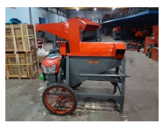
Figure 3. The selected corn sheller machine

3.2. Operation test of corn the sheller machine