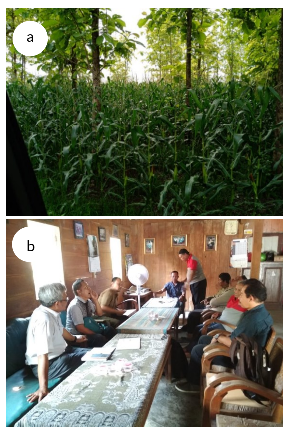
Figure 2. a) Survey on the corn crops area; b) Survey to the LMDH group

were still unable to manage corn storage. Concerning these problems, the community service team agreed to carry out the activities described below.