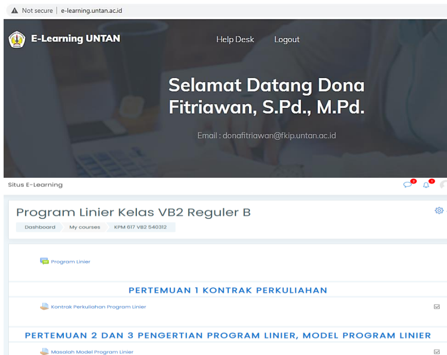
Figure 1. Blended learning based on e learning moodle in the lecture process

DOI: https://doi.org/10.24127/ajpm.v10i2.3571