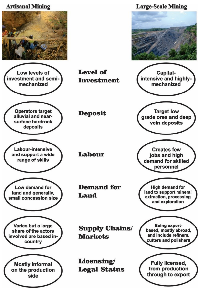
(a) Aligning two (complementary) livelihoods agendas