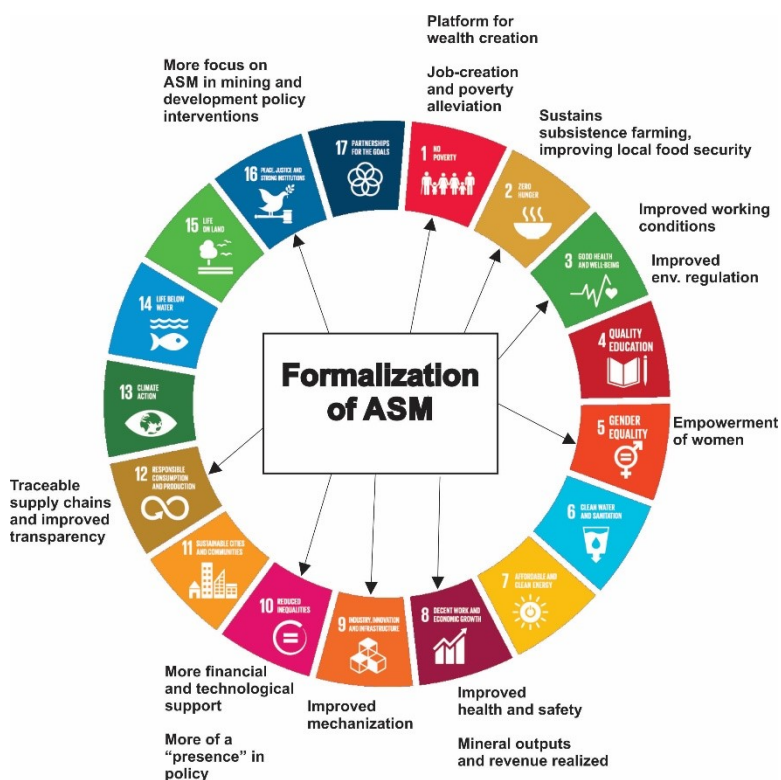
Figure 4: Formalized artisanal and small-scale mining sector and its potential contribution to the SDGs in sub-Saharan Africa