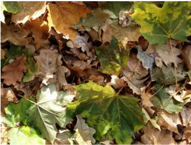
Put landscape waste, such as tree leaves and grass clippings, to good use by creating your own compost.

Fall is a great time for composting and there are many ways it can be done. Putting your landscape plant materials — such as tree leaves, grass clippings, food vegetative waste and garden waste — to good use provides many benefits to the landscape and also lightens the load on our landfill.